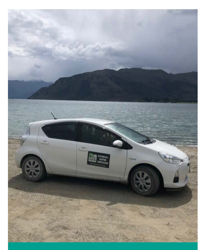
Expect to see our Responsible Camping Ambassadors, and their snazzy electric cars, out and about this summer.

With the expectation that our district will host more domestic campers this summer compared to the usual number of international visitors, we'll soon have a better understanding of whether there are behavioural differences between these groups.