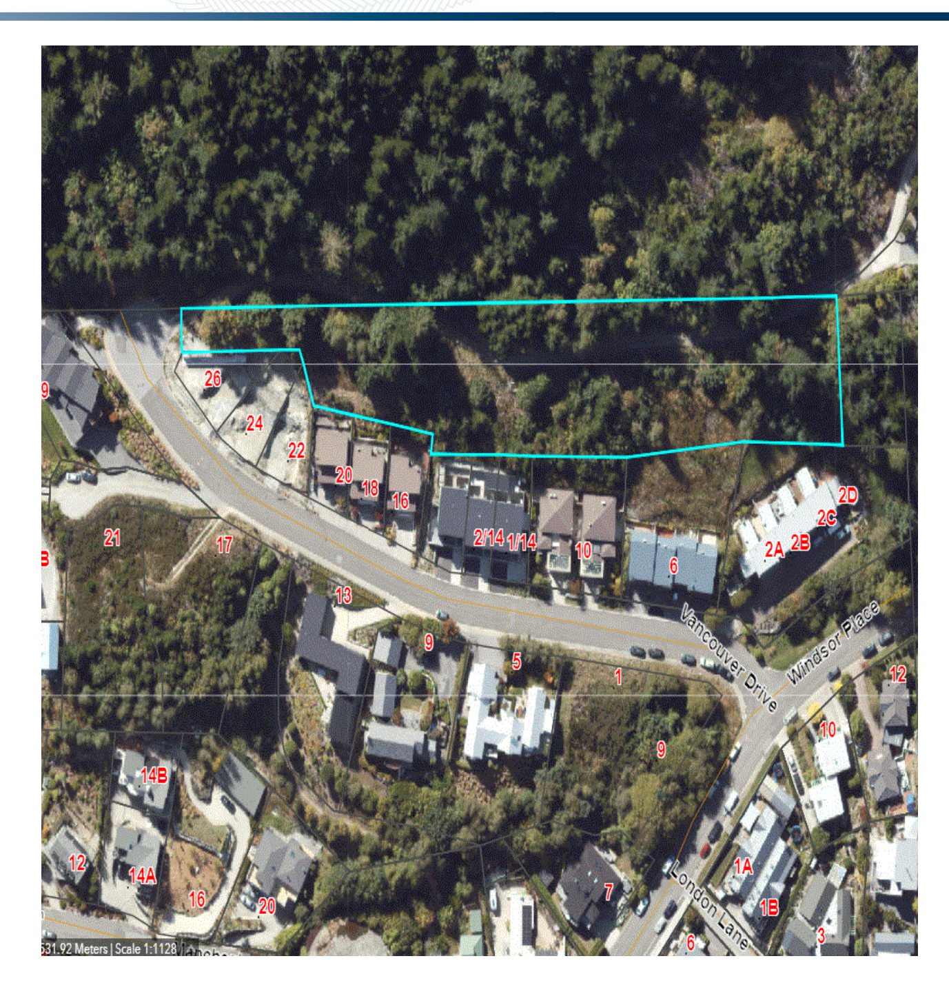
Section 2 SO 503041