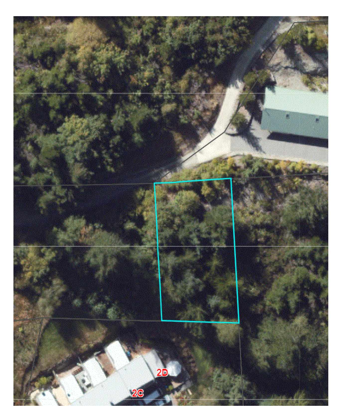
Part Lot 1 DP 21763