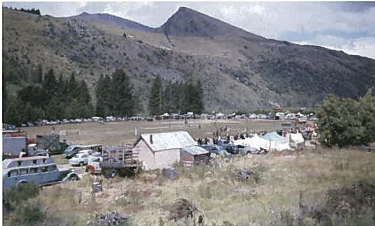
Figure 10. Sports Day at the Arrowtown Recreation Reserve, c.1960s. Murray Collection, Lakes District Museum Collection, EL3167

Jack Reid Park is named after Jack Reid, the last mayor of the Arrowtown Borough Council. His father and grandfather also held the same position.