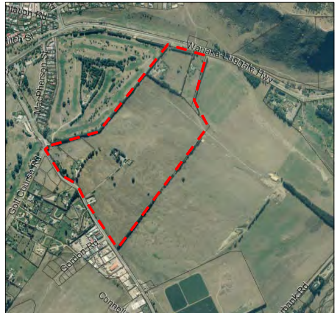
Figure 1 – Plan Change area

The rezoning of this land stemmed from the Wanaka 2020 community workshops in 2002, which identified the area and its proposed uses. Following this, the Council produced a Growth Options Study which paved the way for the Growth Management Strategy, which established the Council's policy on where growth should occur. In line with the Growth Options Study and the Wanaka 2020 Plan, the draft Wanaka Structure Plan was produced. The first version was adopted in 2004 as a working draft only, in order to enable full consideration of the transport effects of the development proposed and more consideration of the amounts of land needed to cater for the next 20 years of growth prior to adopting it in its final form.