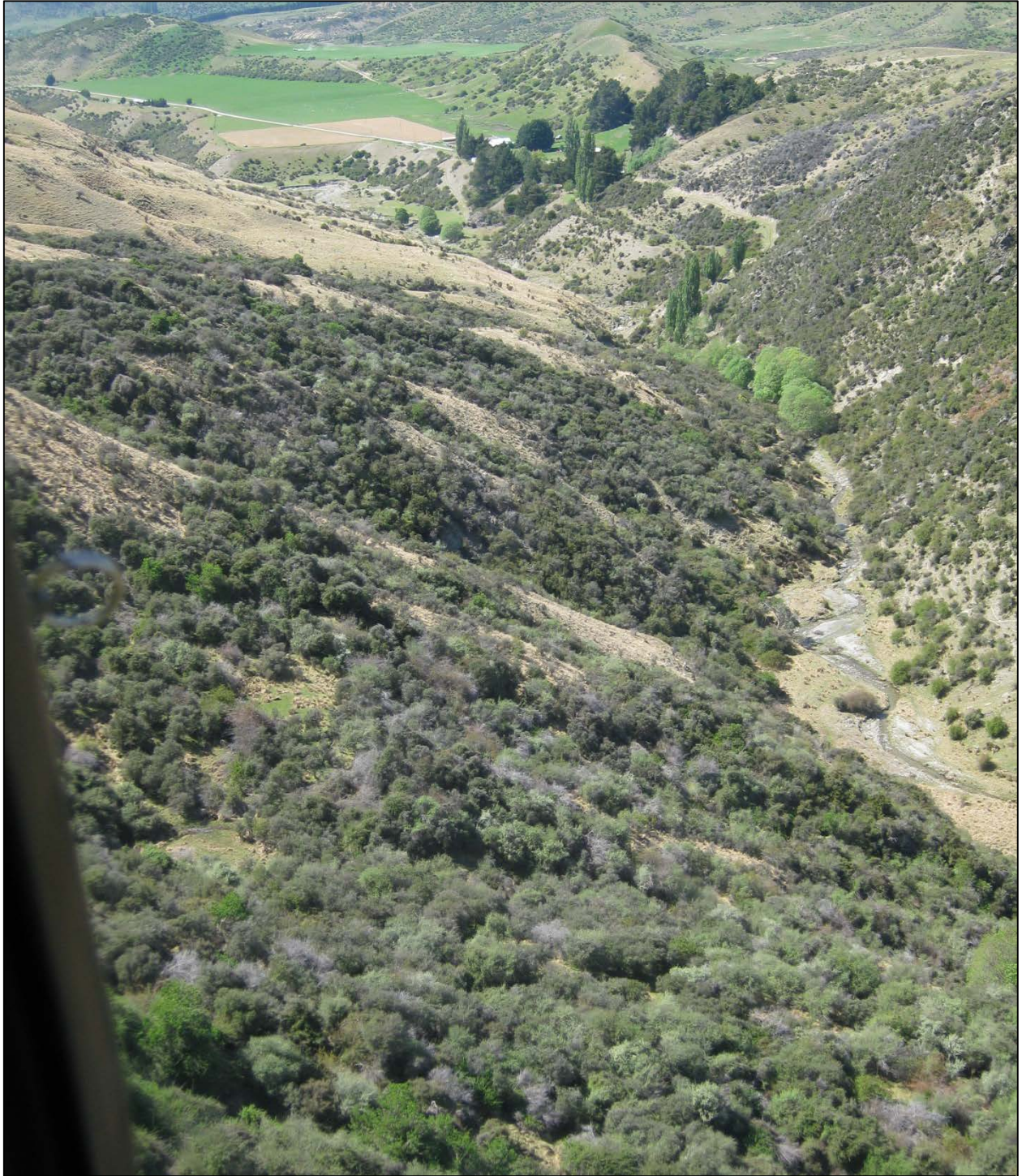
Figure 2: Eastern end of Branch Creek SNA C (lower MacDonaldis Creek), looking east toward Cardrona.