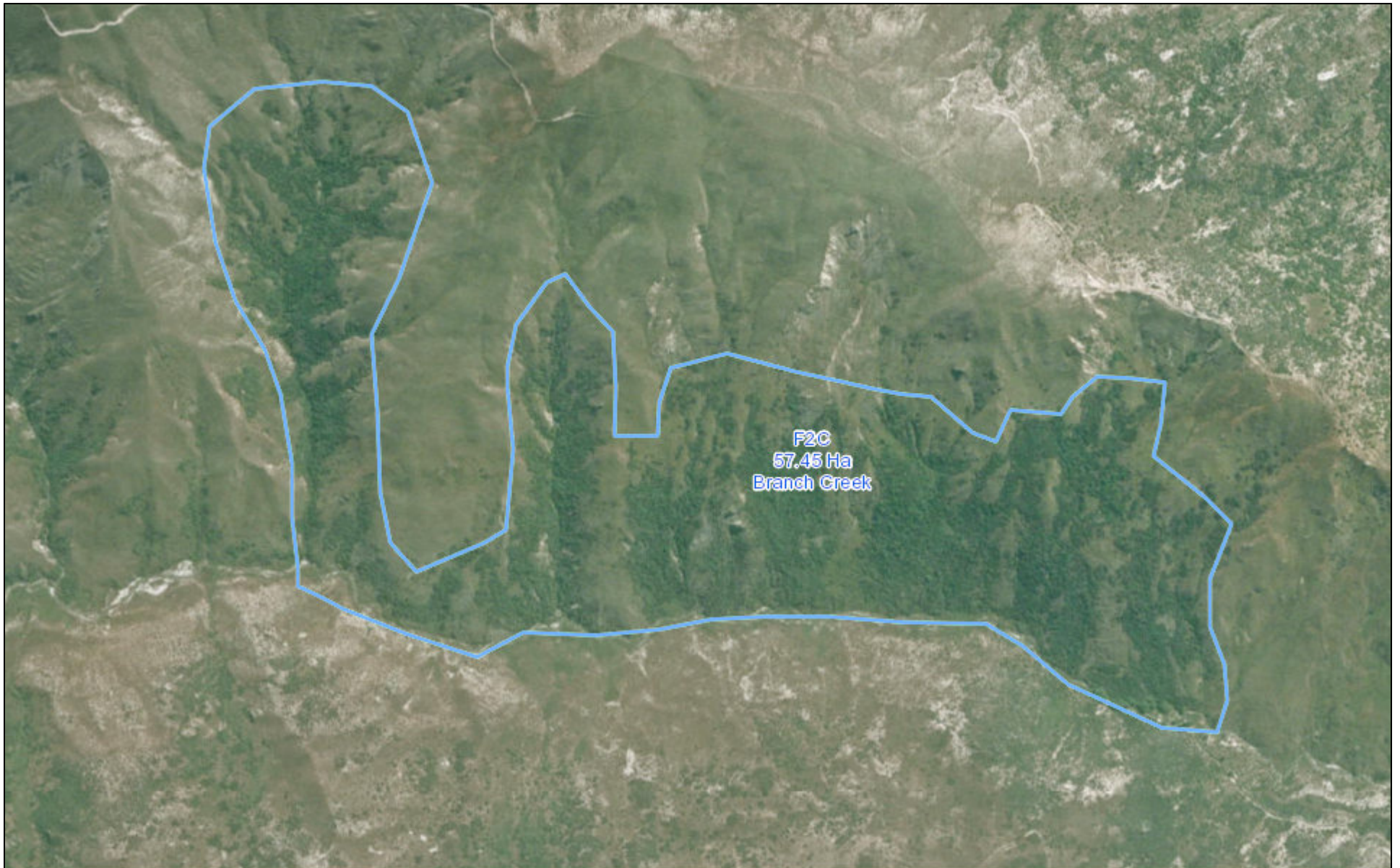
Figure 1: The area of potential significance - Branch Creek SNA C - F2C.