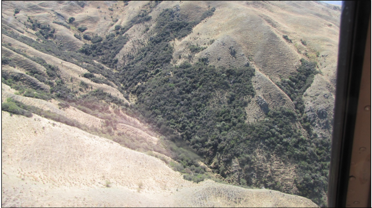
Figure 3: Western end of Branch Creek SNA C .