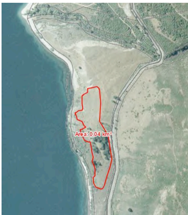
Figure 9-2 - Aerial photograph of the Wye Creek Block land subject to the submission. (approximate), outlined in red.

14. The submission concerns two areas of land on Loch Linnhe Station which is a very large pastoral lease property on the eastern side of the southern arm of Lake Wakatipu. The first area lies between SH6 and the lake just to the south of Wye Creek, as shown on the attached Figure 9-2.