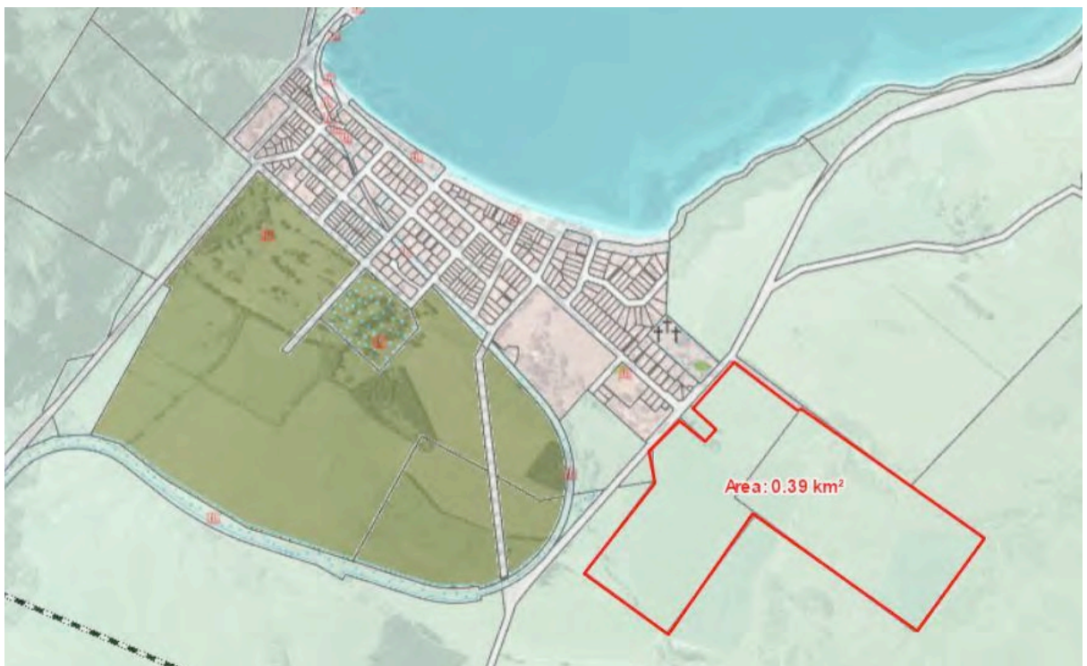
Figure 9-6 - The land subject to the submission is outlined in red. The pink shading is Township Zone and the khaki is the Kingstown Village Special Zone from the ODP. The remaining land is zoned Rural. 17

65. The property is situated on the eastern side of SH6 immediately opposite the township of Kingston. The property is shown on Figure 9-6 below. The land slopes gently upwards towards the foot of the adjacent mountain range.