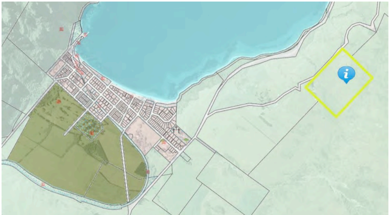
Figure 9-4: location of submission site. The land subject to the submission outlined in yellow. The pink shading is Township Zone and the khaki is the Kingston Village Special Zone from the ODP. The remaining land is zoned Rural.

36. It is located on a gently sloping area of lake beach deposits, with its south eastern boundary close to the steeper mountainside.