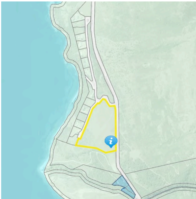
Figure 9-1: Aerial photograph of the site subject to submission (highlighted yellow). The blue shaded area to the south is an ODP zone not relevant to this report. 1

5. The site is adjacent to SH6 immediately to the north of Wye Creek, between the road and a group of rural dwellings at Drift Bay Rd and Vista Terrace adjacent to the lake. It is shown on Figure 9-1 below. The site contains one existing dwelling and has had extensive restoration planting since 1999. It is on an elevated sloping fan adjacent to the road, at the foot of the Remarkables Mountains. The existing settlement is at a slightly lower elevation on more steeply sloping land towards the lake. The dwellings in the existing settlement are further from SH6 than the subject land but are visible from the highway, partially screened by plantings.