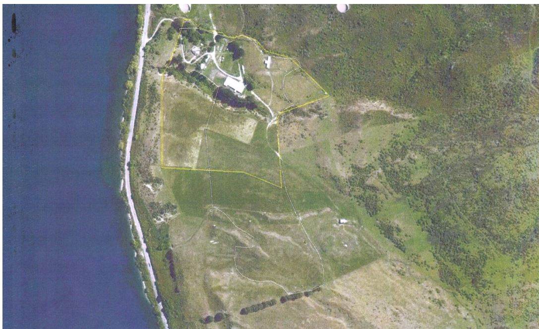
Figure 9-3 - Aerial photograph of the Home Block land subject to the submission (approximate) Original submission outlined in yellow, amended request in white.