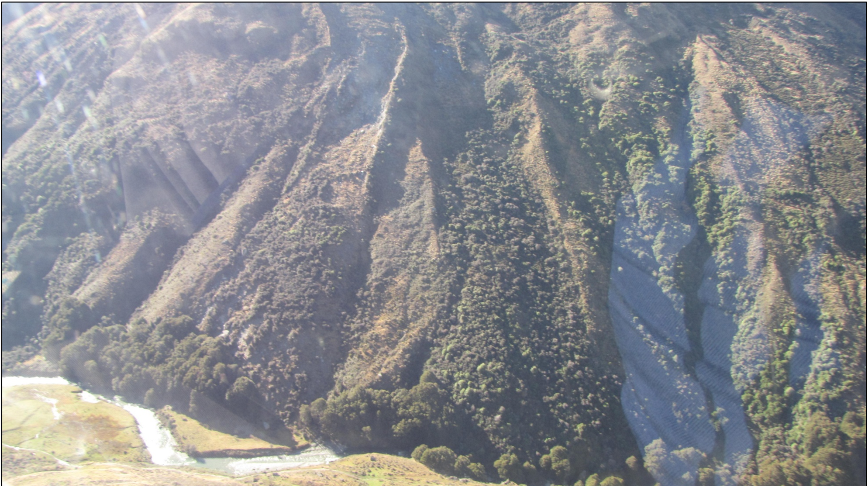
Figure 2: Minaret Burn - photo taken from the south side of Minaret Burn within the Minaret Burn valley – shows the vegetation on the lower slopes with beech forest at the toe of the slopes.