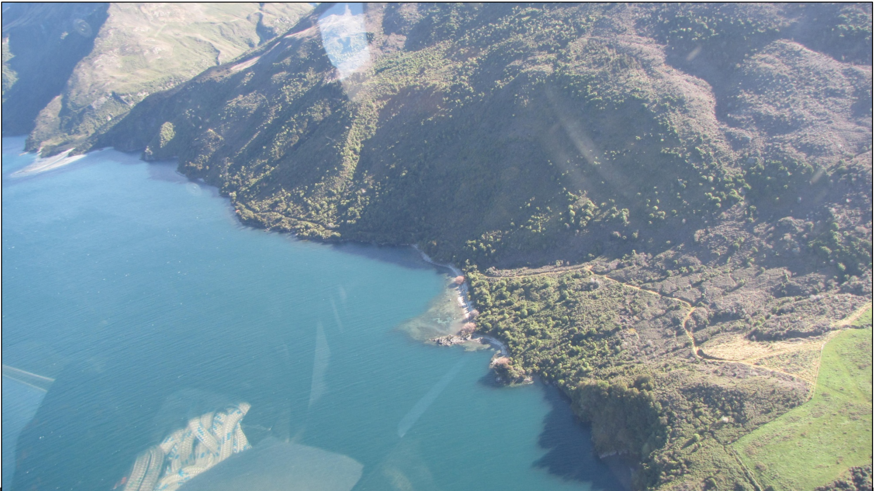
Figure 3: Photo looking southwest toward Minaret Burn – shows the development of the broadleaved forest.