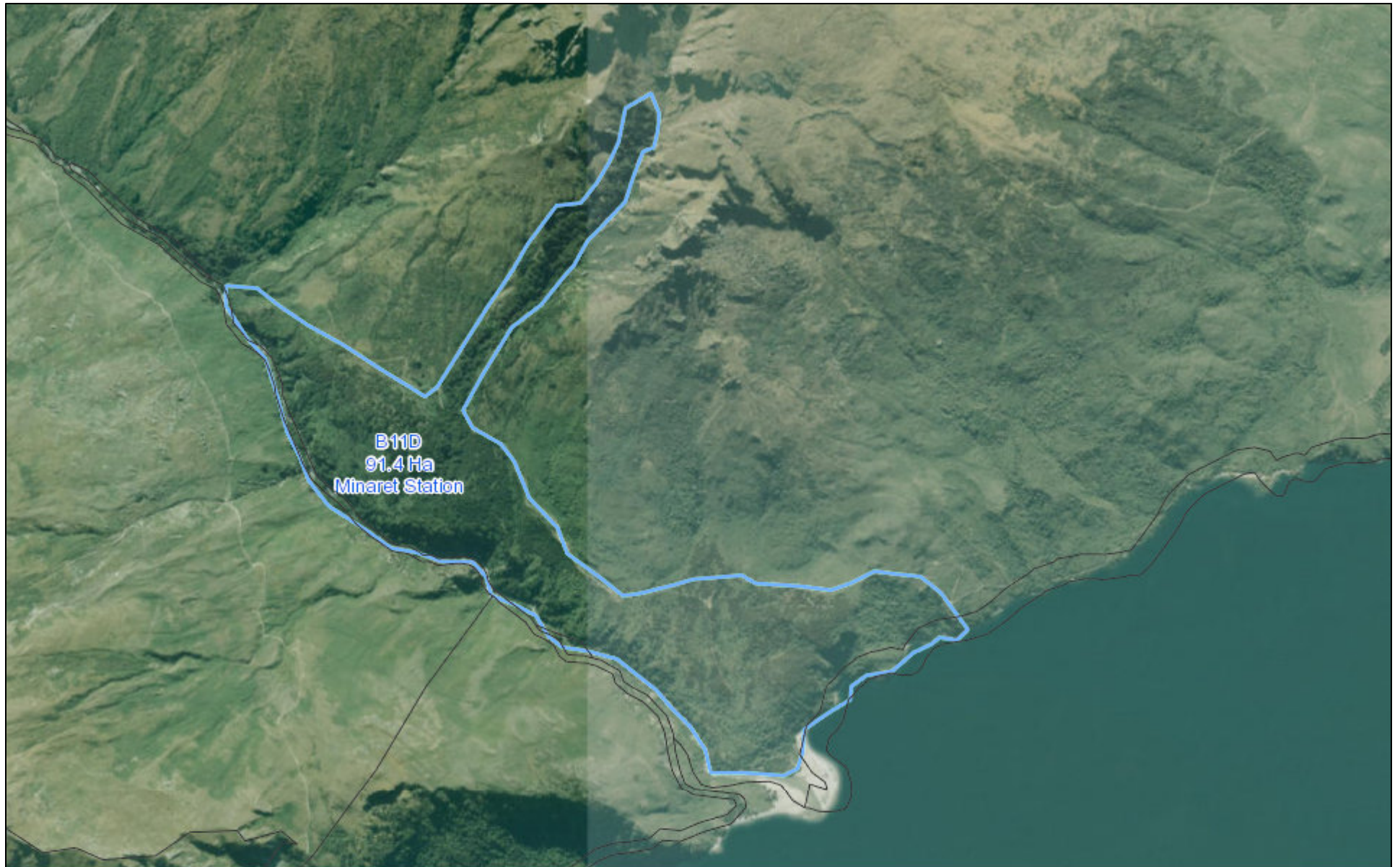
Figure 1: The area of potential significance - Minaret Burn SNA D - B11D.