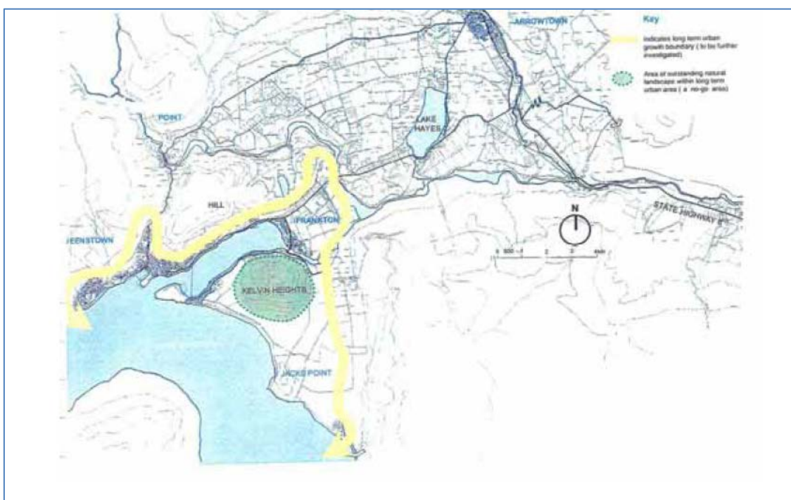
Figure 1 Growth Concept – Long Term Growth Boundary (Tomorrow's Queenstown 2002; Growth Management Strategy for the Queenstown Lakes District 2007)

In Queenstown, the urban edge was defined to the west by Fernhill, to the east by the Shotover River, and to the south by the southern edge of Jacks Point (Refer Appendix Four and Figure 1 below).