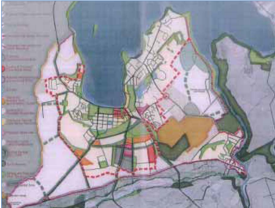
Figure 2 Wanaka Inner and Outer Urban Growth Boundaries (Draft Wanaka Structure Plan 2004; Growth Management Strategy for the Queenstown Lakes District 2007)

For Wanaka, the Draft Wanaka Structure Plan identified both an inner and an outer growth boundary (Refer Figure 2). These boundaries were subsequently reviewed and refined within the Wanaka Structure Plan Review 2007 (Refer Figure 3).