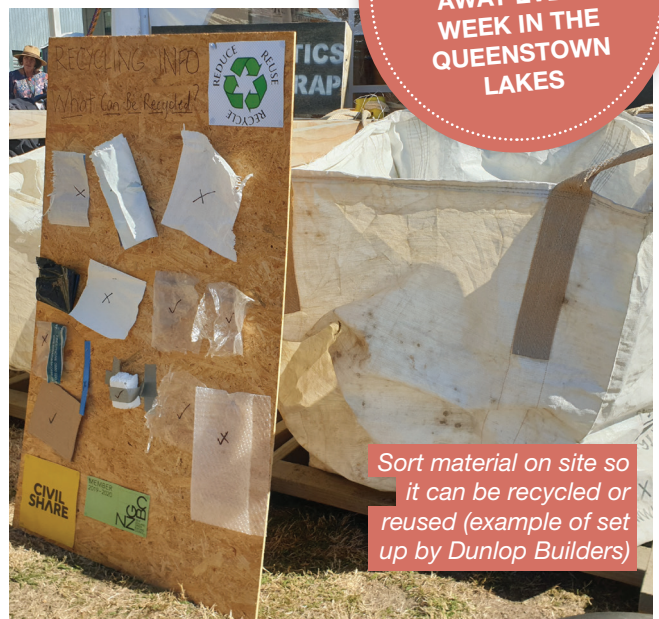
Sort material on site so it can be recycled or reused (example of set up by Dunlop Builders)