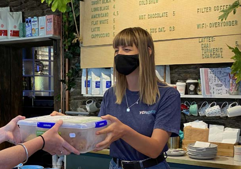
Yonder staff participating in KiwiHarvest's food rescue mission.