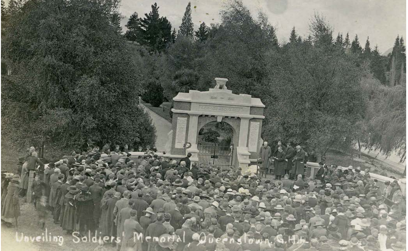
Unveiling the Fallen Soldiers Memorial in Queenstown, photo dated 9 May 1922.