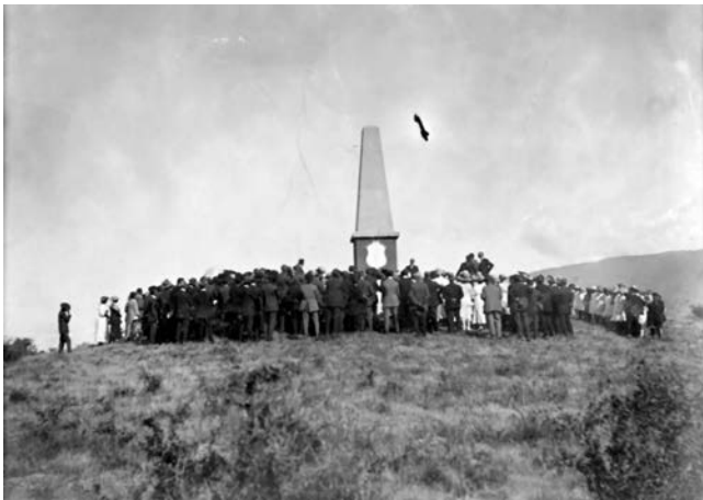
Wānaka War Memorial unveiling, 20 February 1922.

Council offices including our libraries will be closed to commemorate Anzac Day on Monday 25 April. Facilities at Queenstown Events Centre and Wānaka Recreation Centre will be open from 1.00-8.00pm.