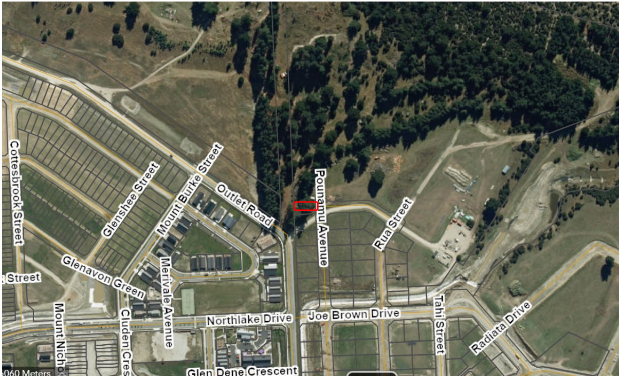
Figure 2: Aerial view of the proposed subdivision location with the approximate location of the proposed reserve circled in red