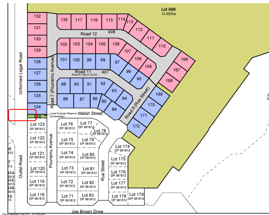
Figure 1: Excerpt of approved subdivision plan RM220008 with proposed reserve circled in red