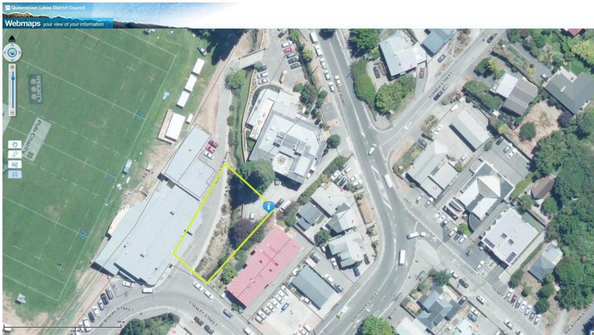
Figure 1 – Section 3 Shown in Yellow. Source – QLDC Website 23.03.15