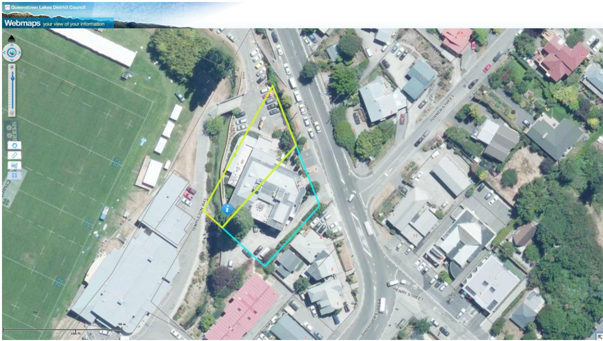
Figure 2 – Section 4 Shown in Yellow Section 5 Shown in Blue.