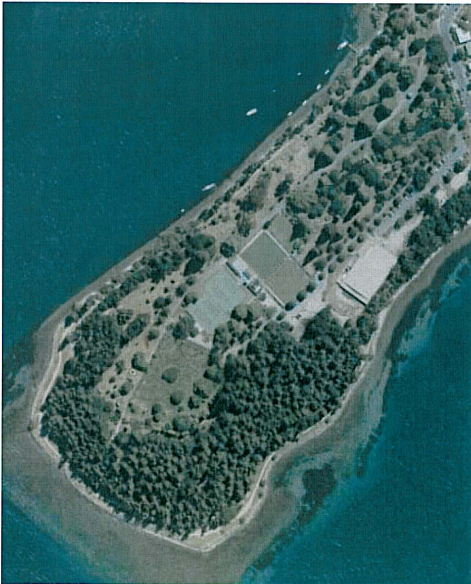
Aerial of the Queenstown Gardens, 2009