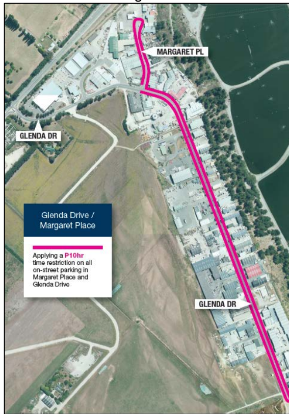
Glenda Drive & Margaret Place