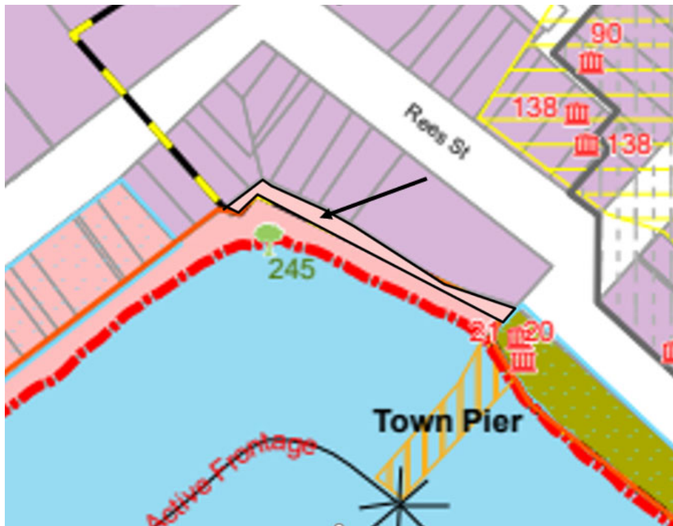
Figure 3 – QTTC Zone to be deleted from the area shown as pink with a bold black outline and replace with Civic Space Zone, as shown.