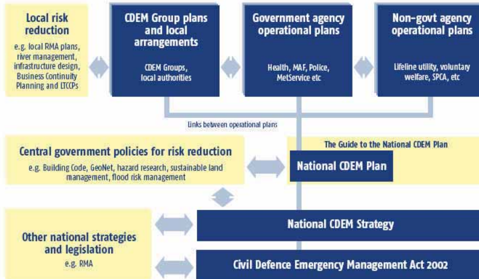
Figure 2 The CDEM Framework

Figure 2 shows CDEM framework and the relationship between the plans.