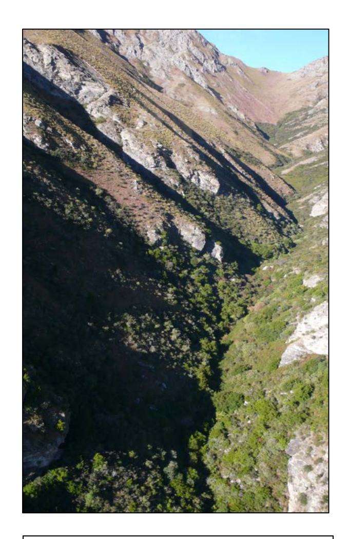
Figure 3: View of shrubland cover within the gully.