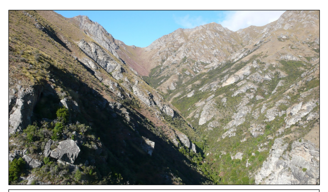
Figure 2: Extensive shrubland cover within the gully and across steep hill slopes amongst numerous bluffs.