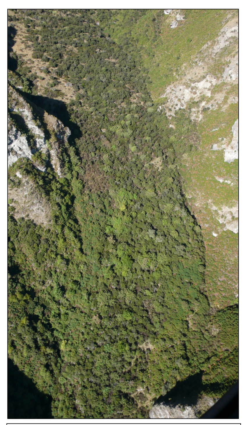
Figure 2: Extensive shrubland cover within broad gully and amongst bordering bluffs.