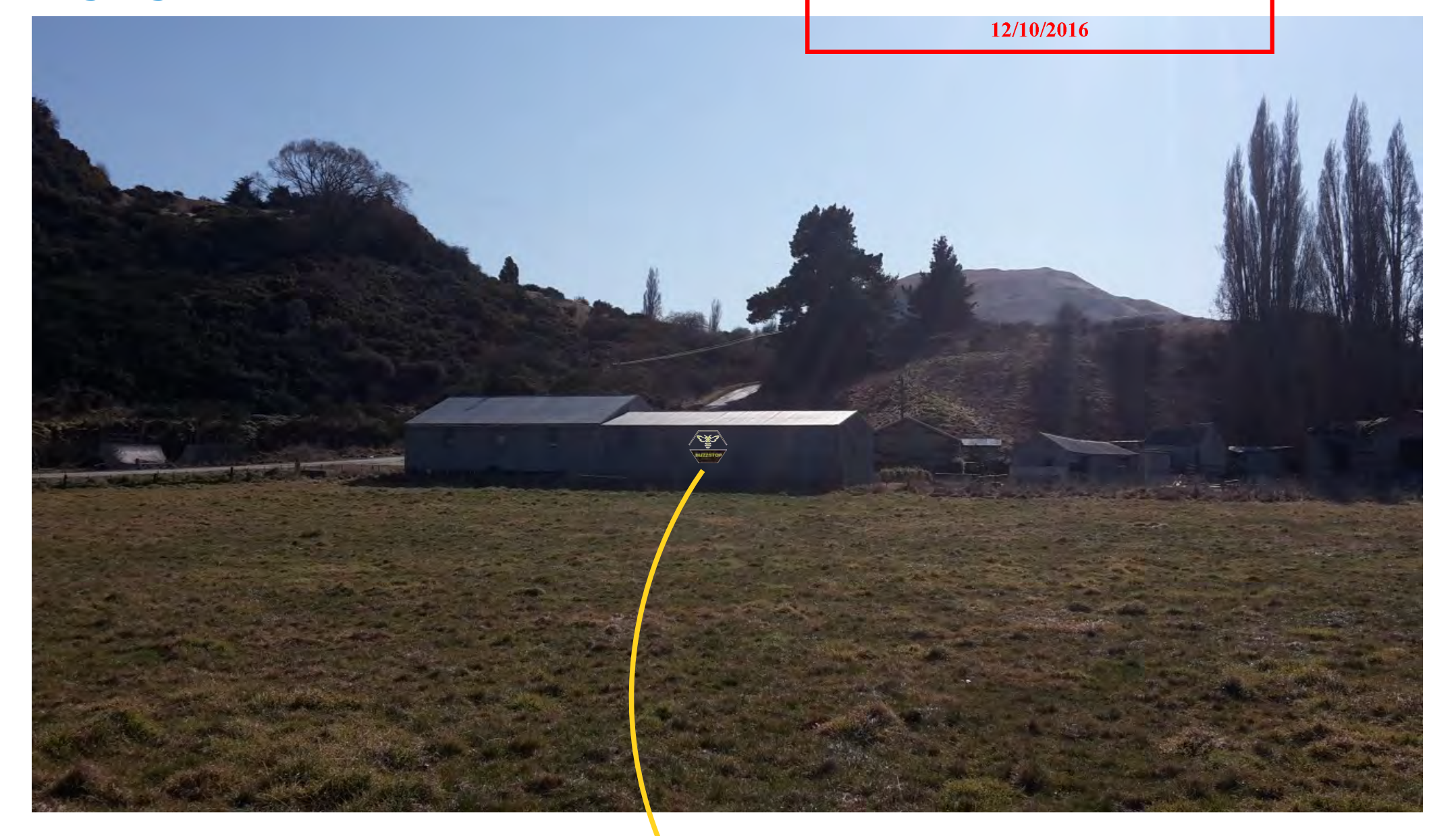
Signage, approx 1.5m wide x 1.5 high