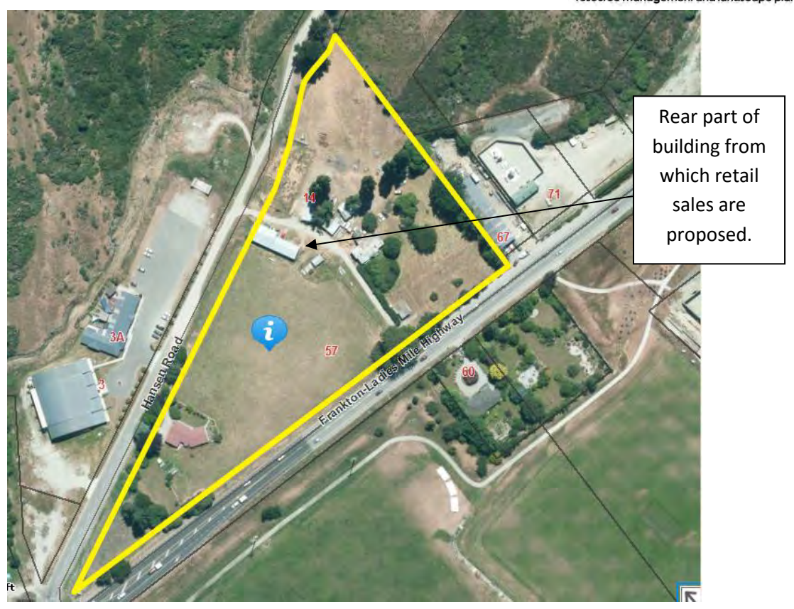
Aerial photo of application site

The barn building which will be used for the retail activity can be accessed via gravel farm tracks across the site from both Hansen Road and Frankton-Ladies Mile Highway.