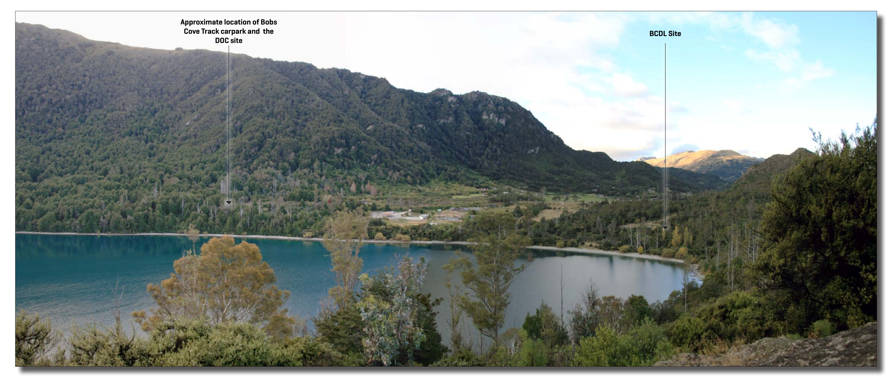
Image 2: View to the northeast from Picnic Point. Image for reference only.