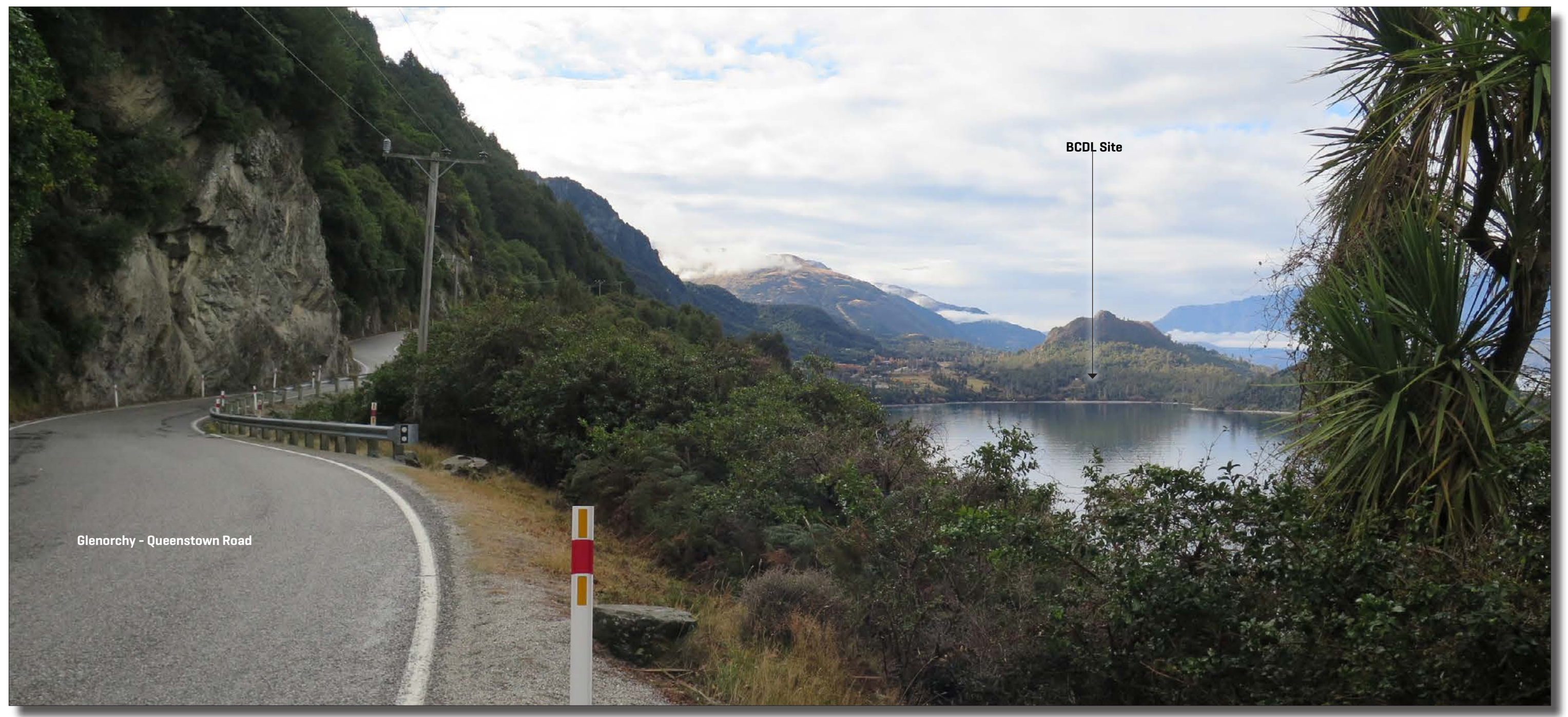
Image 1: View to the east from near Whites Point on the Glenorchy - Queenstown Road. Image for reference only.