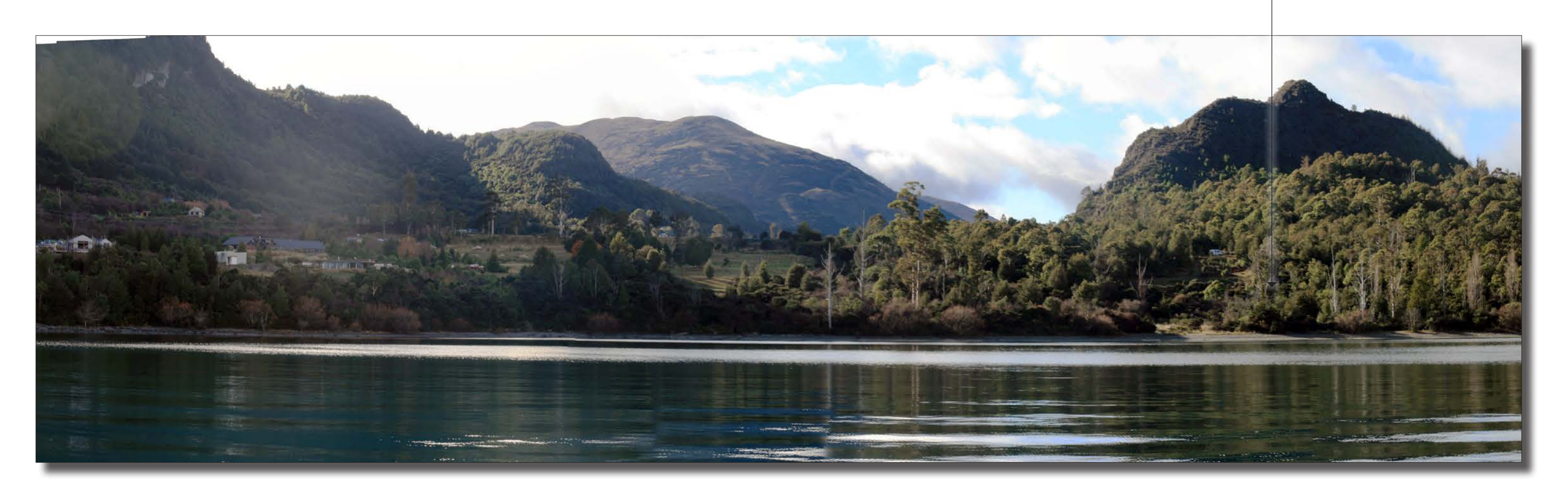
Image 3: View to the east from surface of Lake Wakatiou within Bobs Cove. Image for reference only.