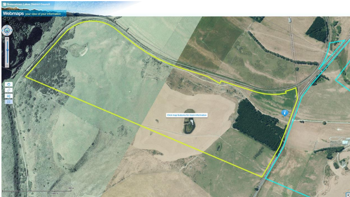
Figure 2. Aerial of Subject Site – Closed Landfill is located in the north eastern corner in the vicinity of the information symbol.

The overall cover letter for the Designations Chapter work includes a web link which will enable interested parties to view this change on the proposed planning maps.