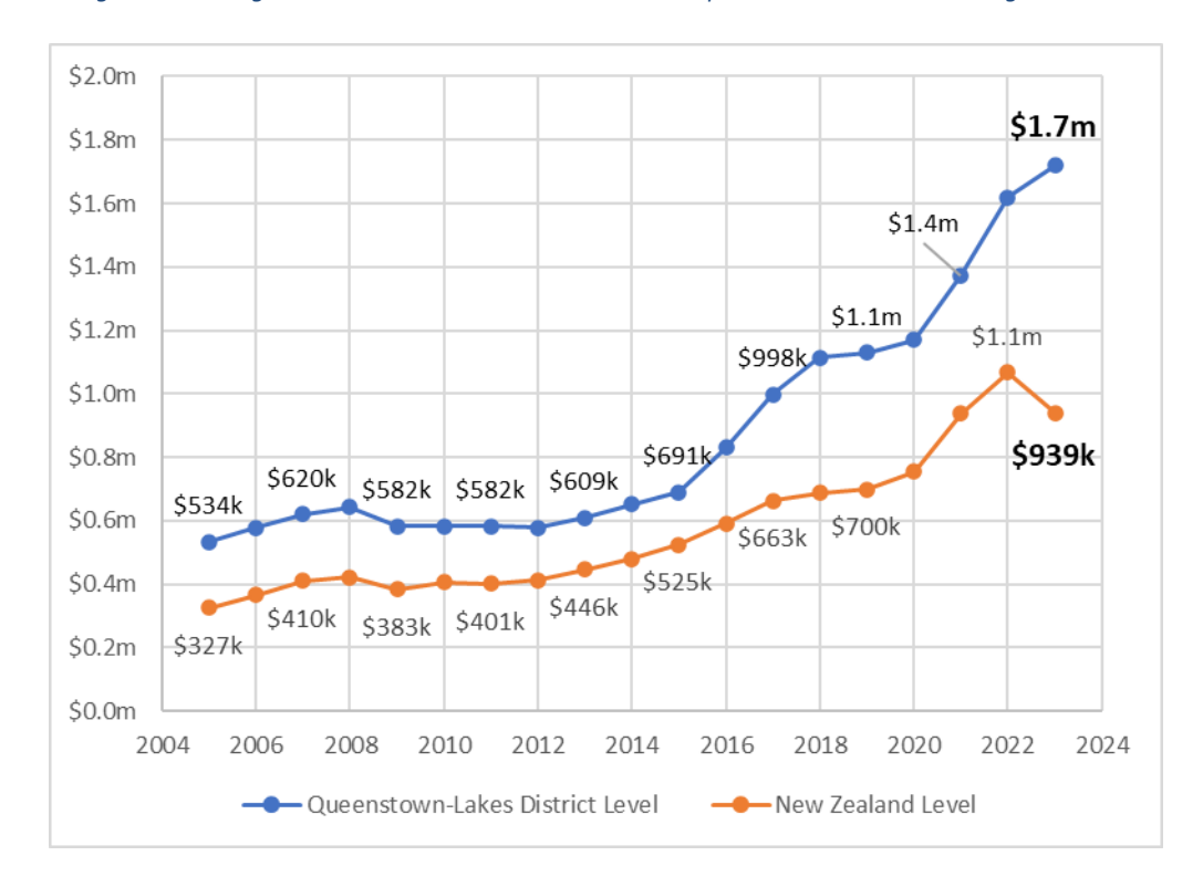
Figure 2: Housing Prices in Queenstown-Lakes District Compared to the National average