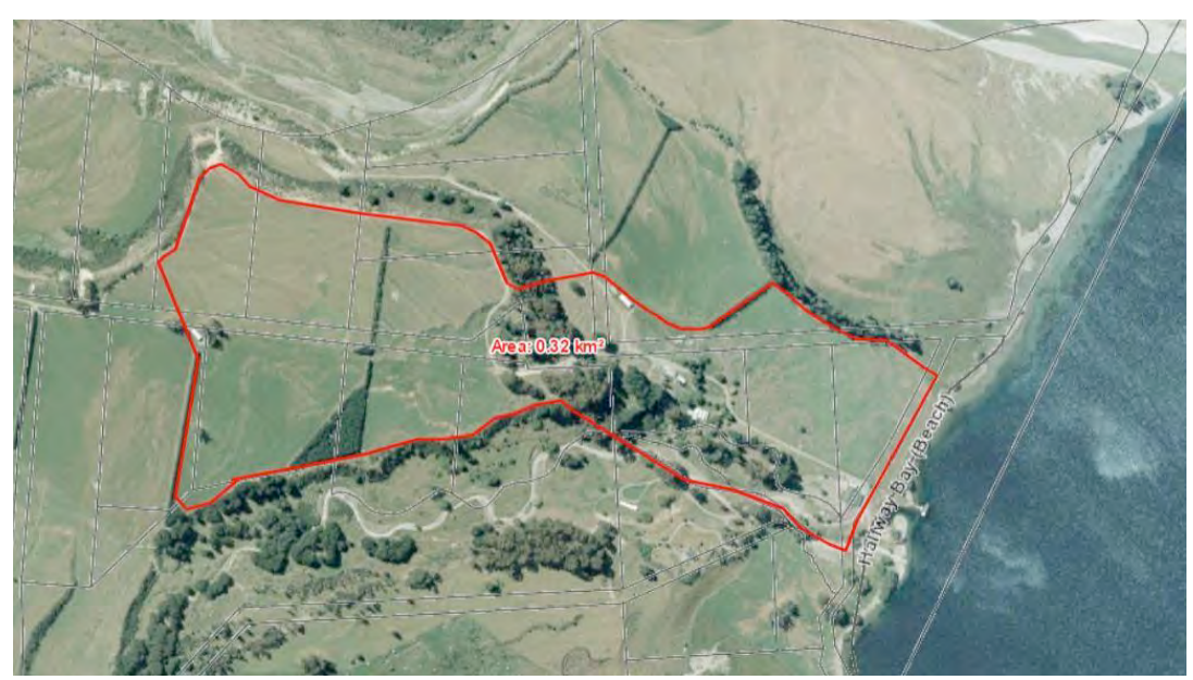
Figure 10-1 - Aerial photograph of the land subject to the submission outlined in red