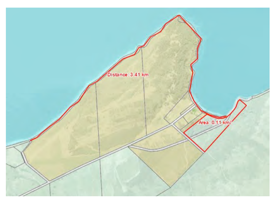
Figure 10-2 – Aerial photograph of the land subject to the submission outlined in red, showing the length of the marginal strip. The ODP Rural Visitor Zone is shaded khaki.