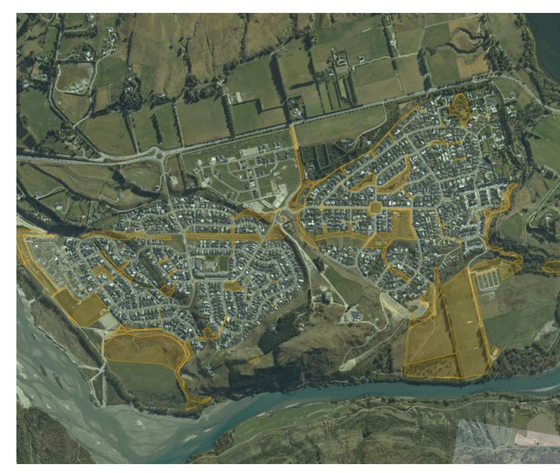
Map of LHESCB reserves

As this relatively new residential community develops, there is an opportunity to reinforce the natural and open character of the reserves through native revegetation, and amenity planting.