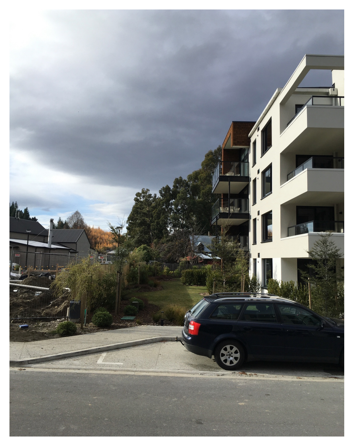
Photo of Arthurs Point Building Related to Boundary (referred to in text)