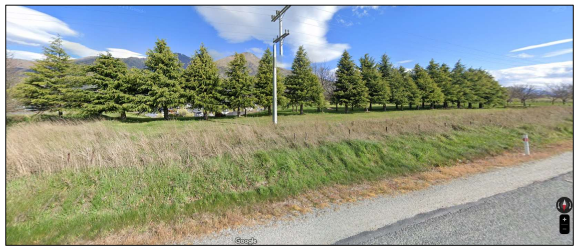
Figure 3: Google Streetview Image of Dobb planting required to screen Lake Hayes Estate but also blocking views of ONL