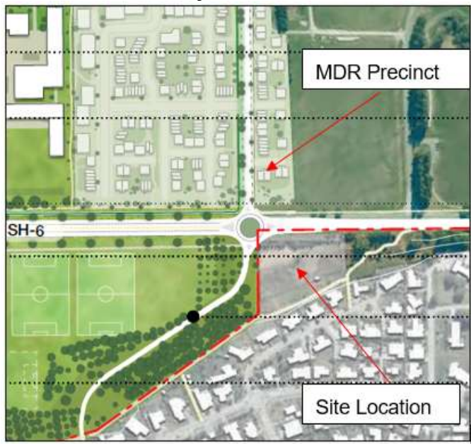
Figure 1 – Indicative Master Plan showing MDR Precinct development opposite the site