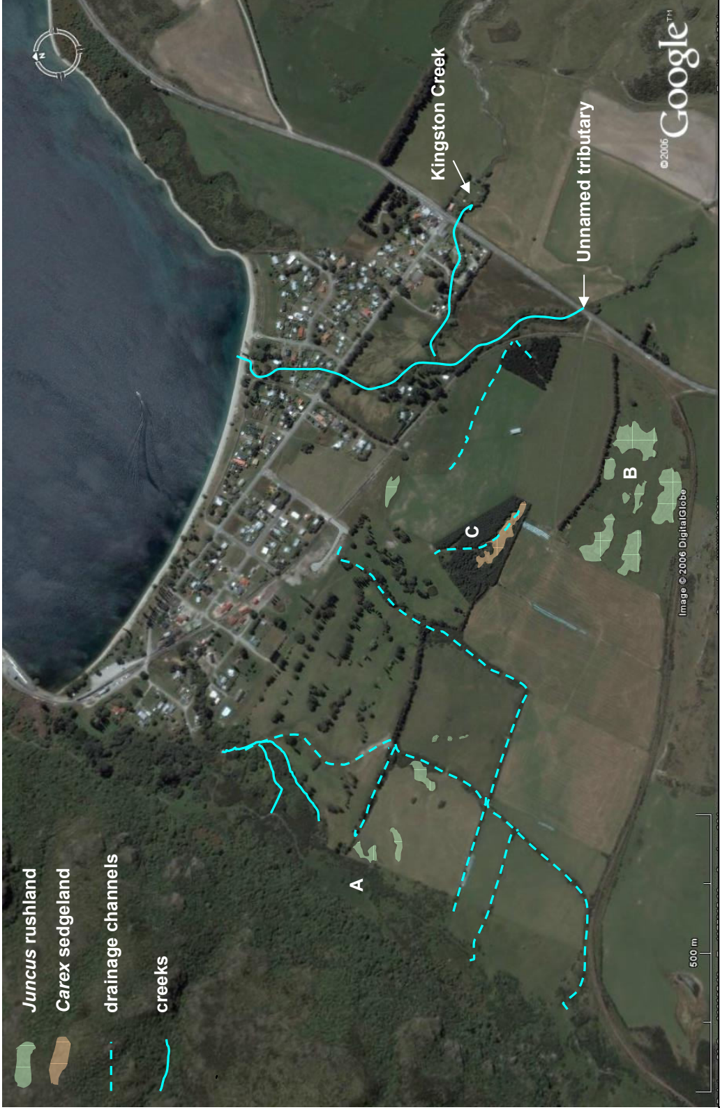
ATTACHMENT D: Location of creeks areas rushland or sedgeland communities, drainage channels and approximate location of culverted flows from the Plan Change site.