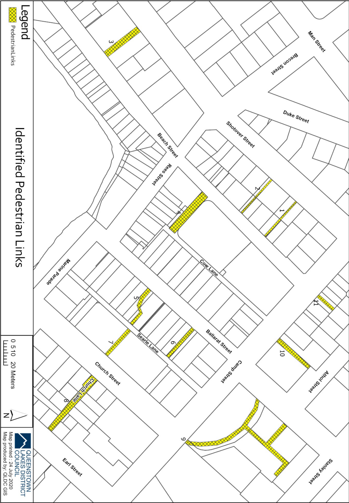
Figure 1: Identified Pedestrian Links