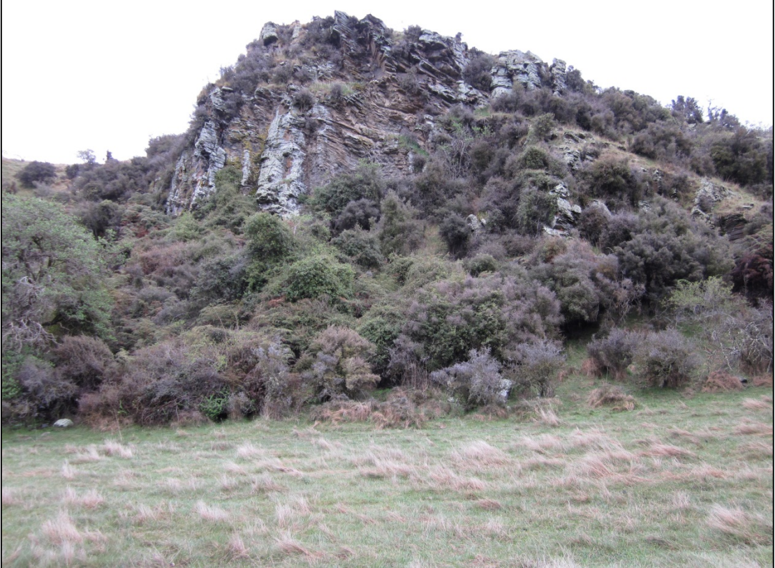
Figure 2: Two representative photographs of the rocky outcrop shrubland.