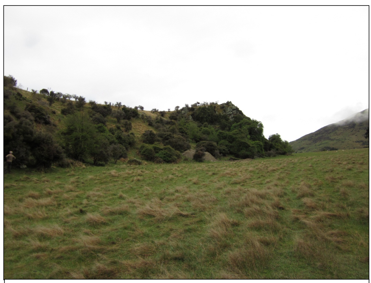
Figure 3: A representative photograph of the rocky outcrop shrubland.