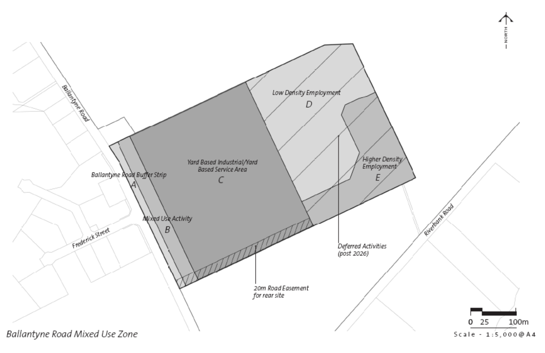
Figure 1: Structure plan