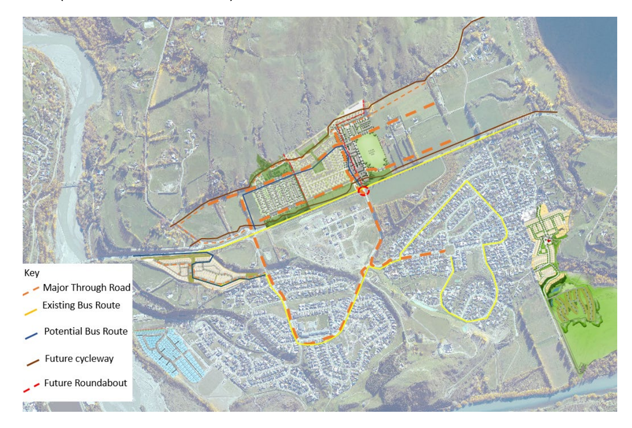
Figure 2: Transport Overview Ladies Mile, Shotover Country, and Lake Hayes Estate