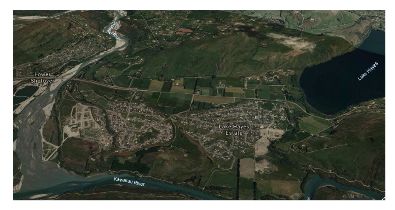
Figure 1: Ladies Mile, Shotover Country, and Lake Hayes Estate

3 As part of the Proposed District Plan (PDP) process, the Wakatipu Basin Land Use Planning Study 2018 recommended that Ladies Mile was highly suitable for more urban development. Due to the narrow scope of submissions and evidence on the lack of capacity of the Shotover Bridge, decisions on the PDP were to zone the area as Rural Lifestyle and Large Lot Residential. This has a possible yield of approximately 20 sections in the Rural Lifestyle Zone and 99 sections in the Large