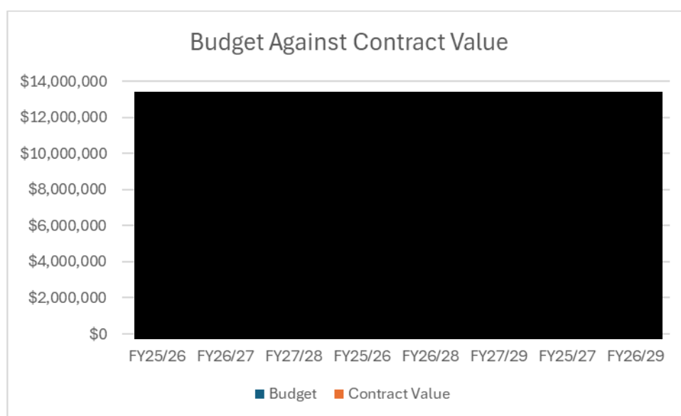
Figure 2- Allows for Contract inflation (annually at an anticipated 3%) but not growth