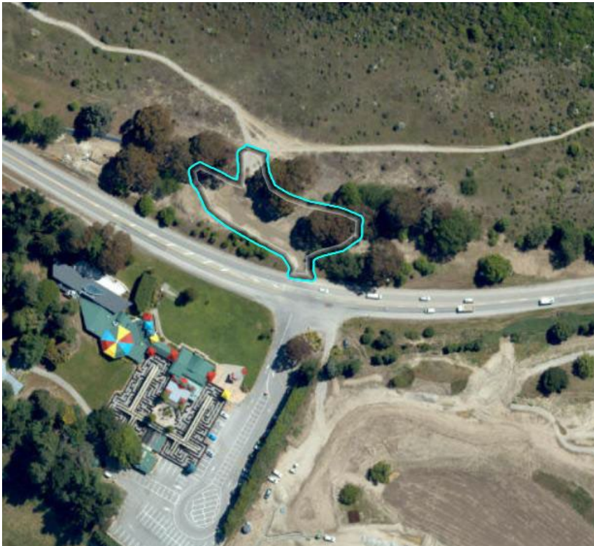
Appendix 5 – State Highway 6A Shotover Street and Stanley Street – identify as prohibited area

Primary Road Parcels – 3171919 (prohibited), 3011745 (prohibited)