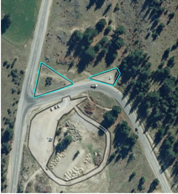
Appendix 4 - State Highway 84 land to the south of Mt Iron Wanaka – identify as a prohibited area

Primary Road Parcels – 3171919 (prohibited), 3011745 (prohibited)