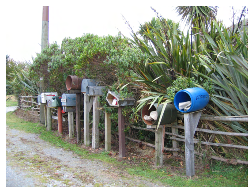
PHOTOGRAPH 3: LETTERBOXES ON THE STATE HIGHWAY ADJACENT TO MAKARORA TOWNSHIP