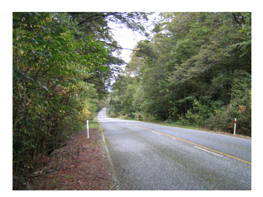
PHOTOGRAPH 1: THE VIEW SOUTH ALONG THE HIGHWAY TOWARDS MAKARORA FROM NEAR TEMPLETON CREEK.

2.5 The ecology of the landscape surrounding and including the Makarora Valley is, in part, reflective of general patterns that can be found throughout the less tamed parts of the Queenstown Lakes District. The Makarora Valley floor is improved pasture. The surrounding lower slopes are grasslands with extensive kanuka. The higher mountain slopes consist of snow tussock grasslands and areas of sub-alpine scrub<sup>4</sup>. This landscape is unusual in terms of the district however, in that there are large tracts of very mature, relatively unmodified beech forest on the mountain sides and broad valleys that are contained within the Mount Aspiring National Park. This is remarkable in terms of the Queenstown Lakes District, particularly since this vegetation is bisected by a well-used highway. Also unusual in terms of the district's ecology are the large tracts of mature kanuka that line part of the northern reaches of Lake Wanaka and the Makarora Valley.