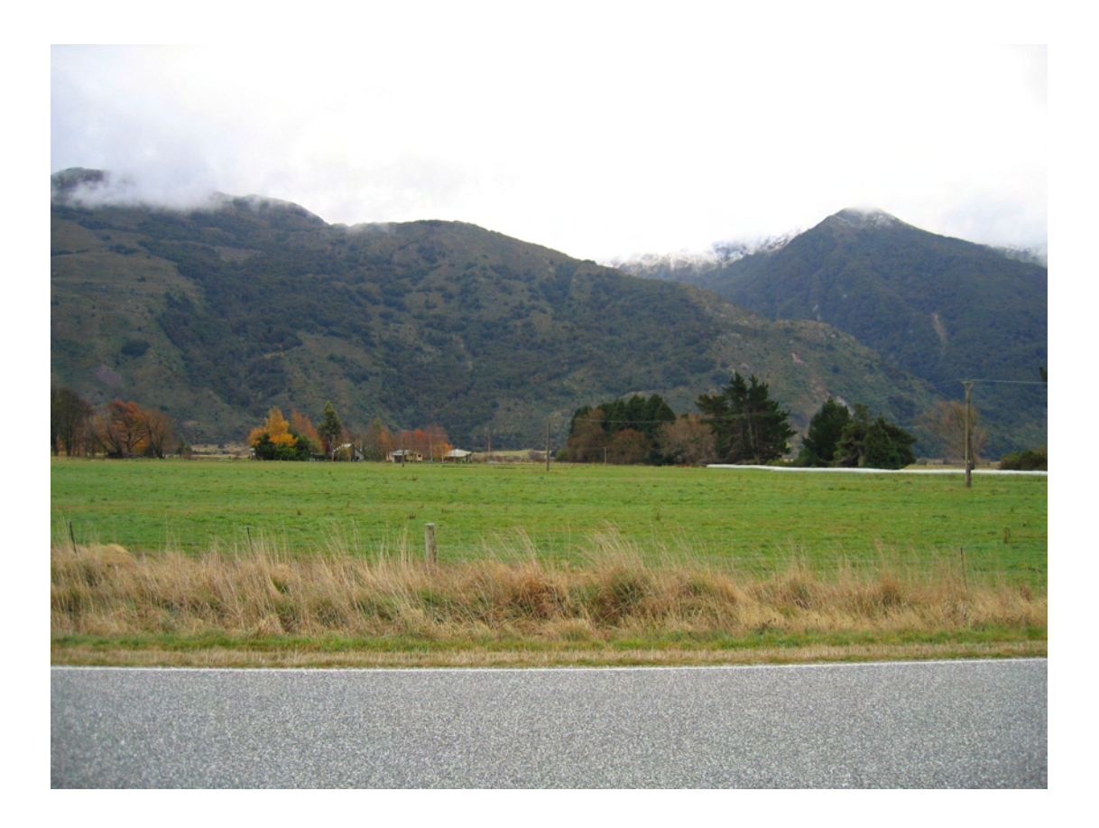
PHOTOGRAPH 2: THE VIEW TOWARDS THE SOUTHERN END OF SCHOOL ROAD FROM THE STATE HIGHWAY

3.3 These flats have obviously been used for farming purposes for many decades. They are covered in lush exotic pasture bisected by post-and-wire fencing. Many mature exotic shelterbelts also bisect the site, generally perpendicular to highway. The valley floor area currently reads as an isolated pocket of human occupation and husbandry, surrounded by a wilder landscape.