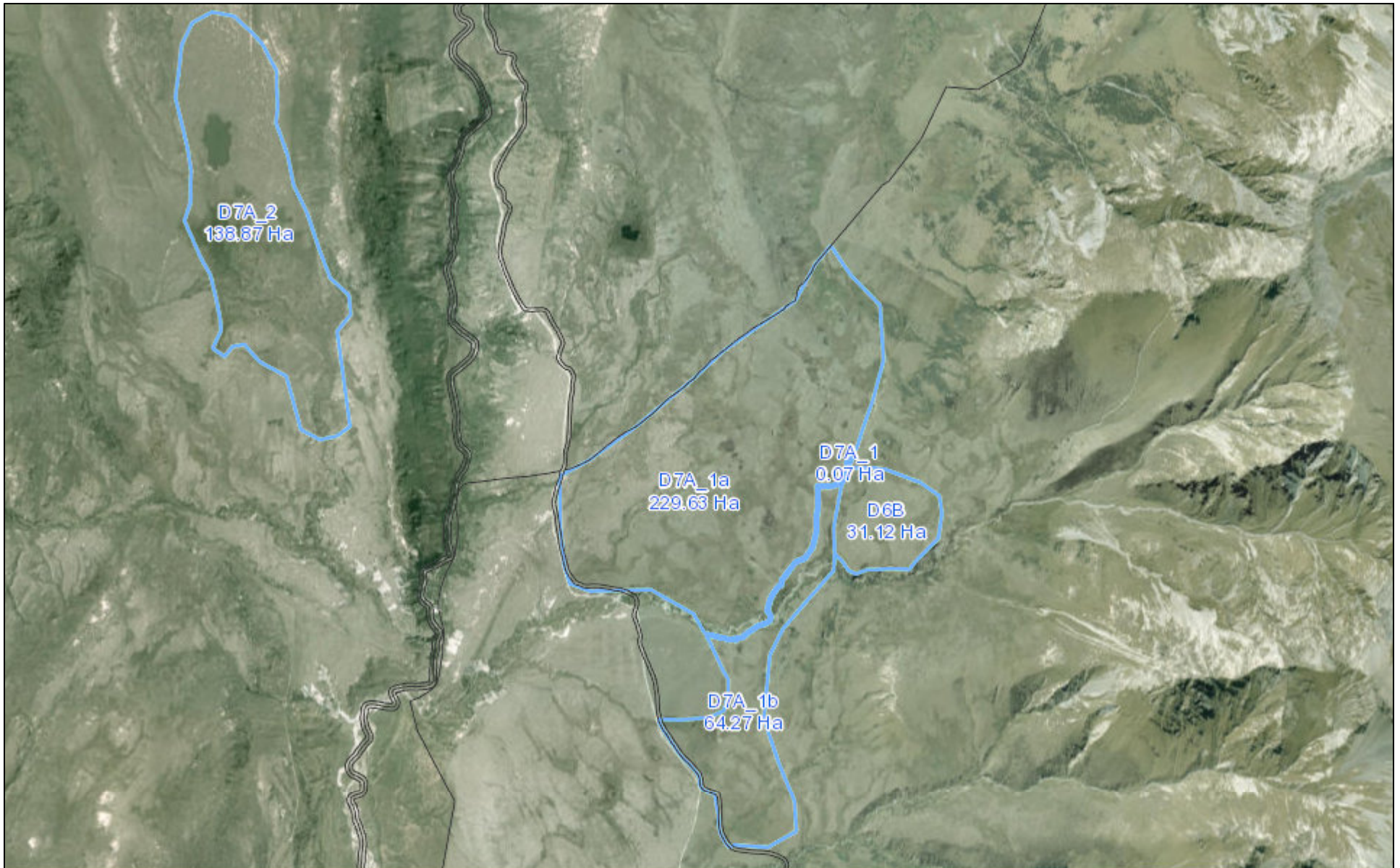
Figure 1: The area of potential significance - North Von, Lower wetlands SNA A - D7A_1-2.