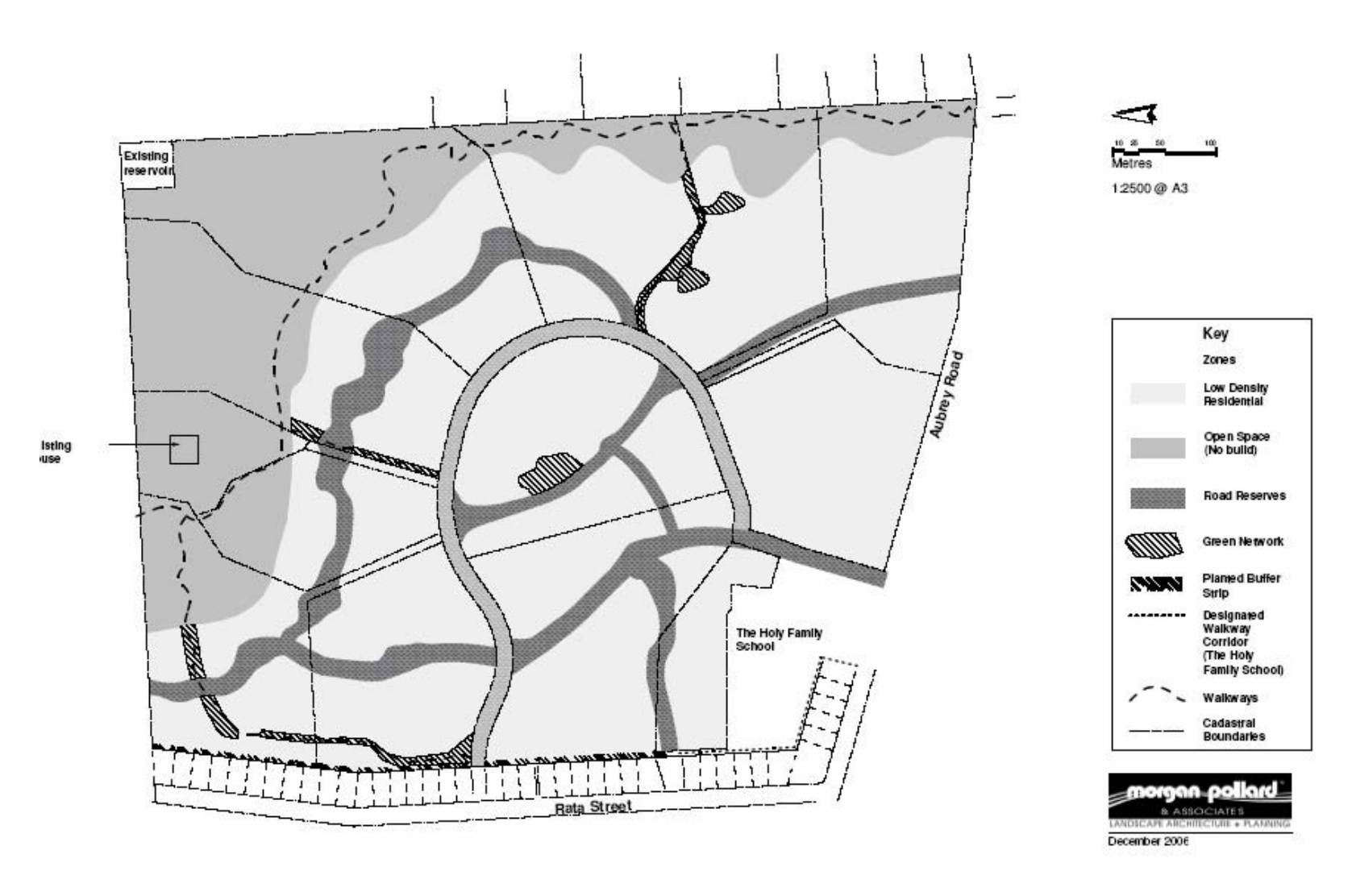
Section 32 Report – Plan Change 13 Kirimoko Block Wanaka DRAFT