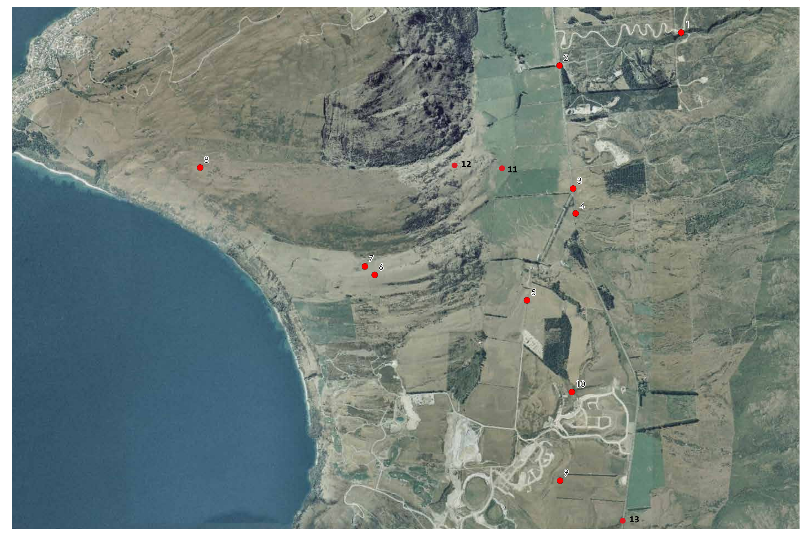
Figure 1: Viewpoint Location Plan