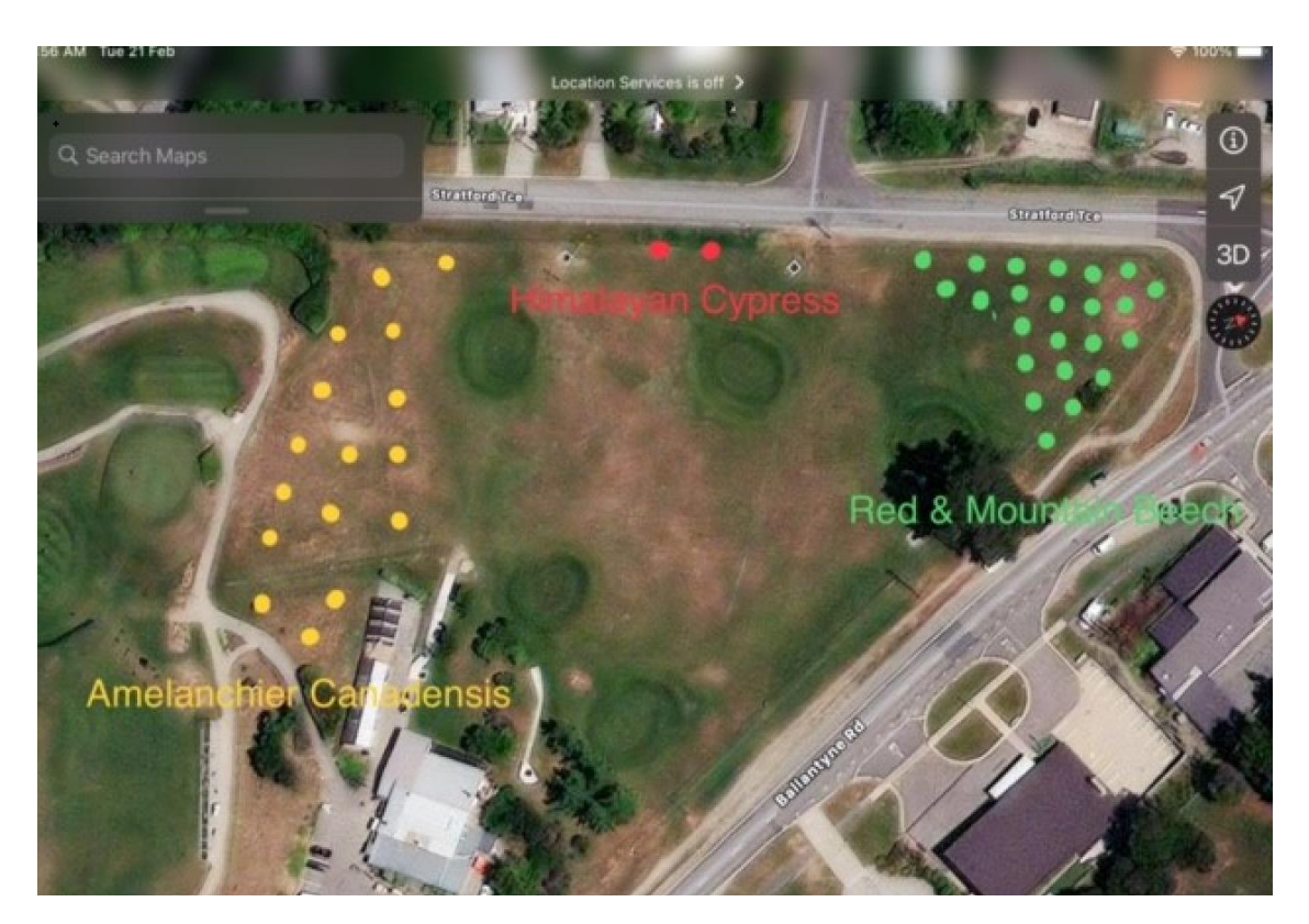
Figure 1: Short Course Planting

Below are planting plans for around the reservoir and for the replacement trees on the course, the species of trees are on each attachment but we may have to substitute with similar trees depending on availability.