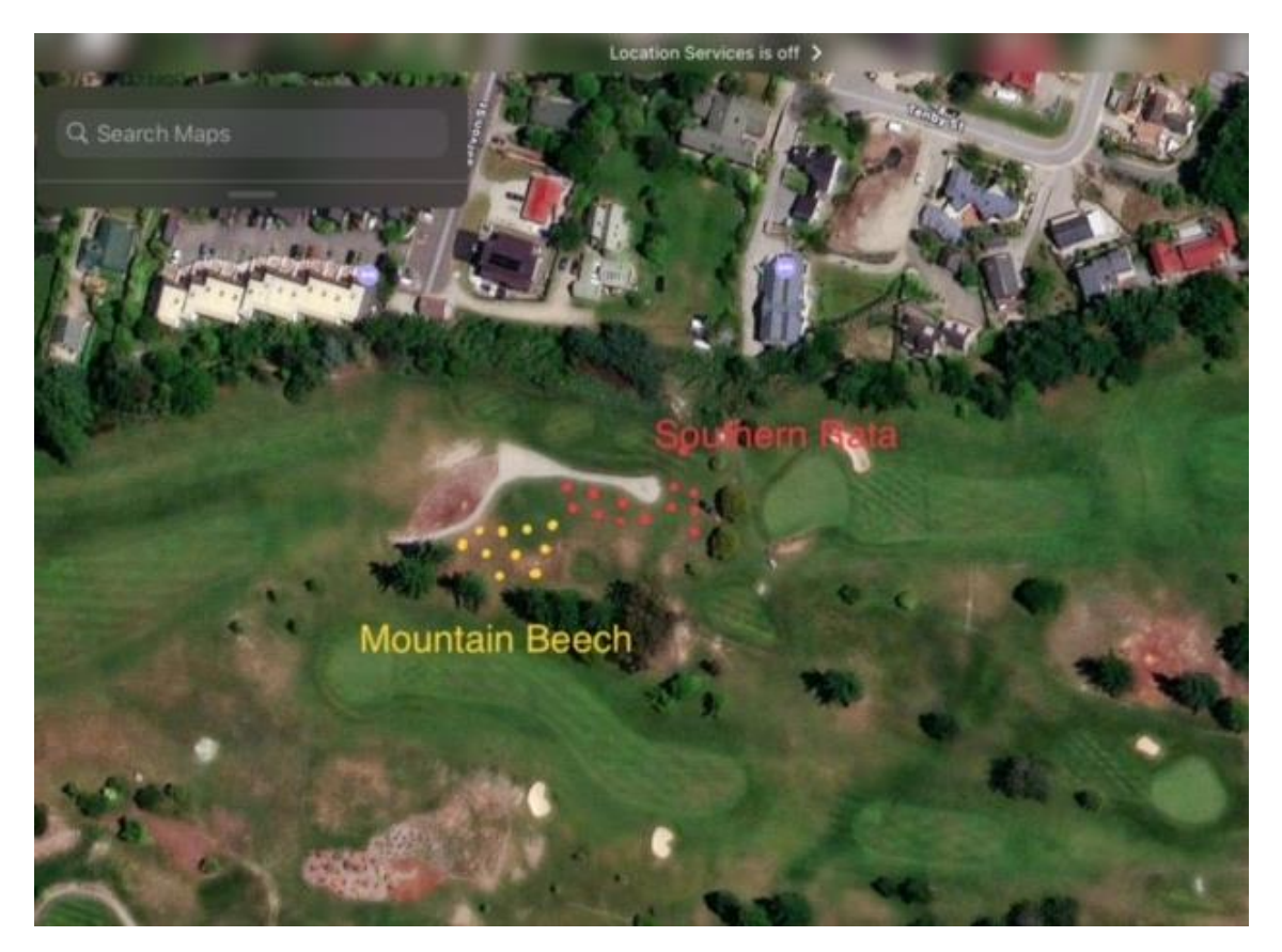
Figure 4: 4<sup>th</sup> Hole Planting