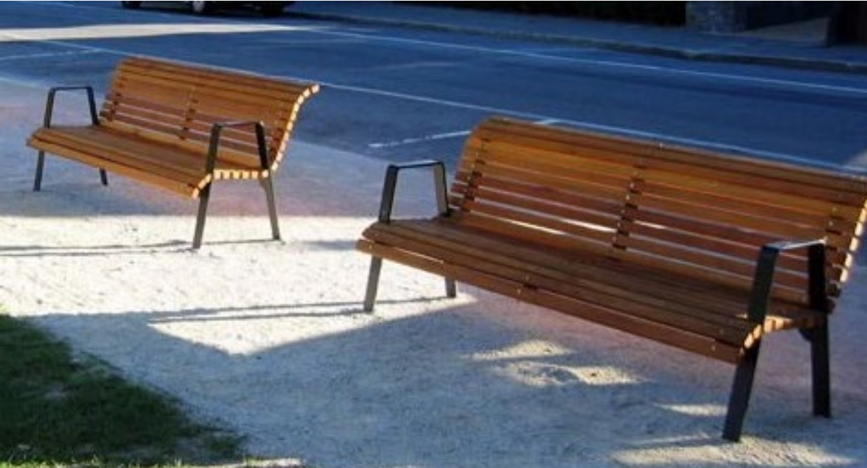
Waihi seat model to be installed