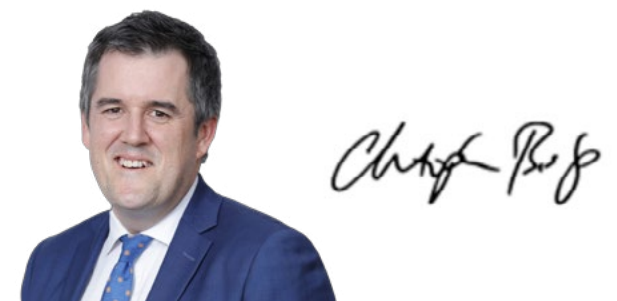
Hon Chris Bishop Minister Responsible for RMA Reform

Together, the Head Start pathway and the backstop approach provide certainty and confidence, supporting councils to lead where they are ready, while setting the system up to work better for the long term and delivering the new planning system.