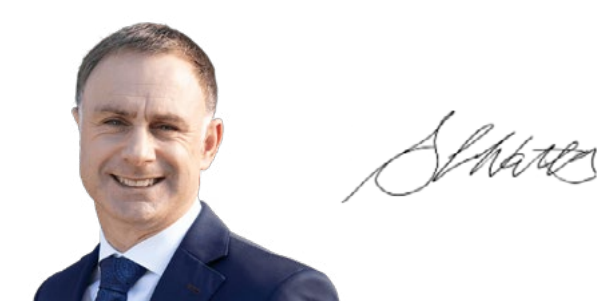
Hon Simon Watts Minister of Local Government