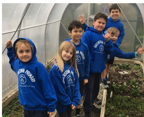
Queenstown Primary School’s Enviro Group learning about the Greenhouse Effect in their tunnel house.