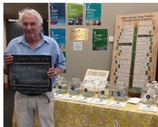
Climate action kōrero at the 2021 WAO Summit