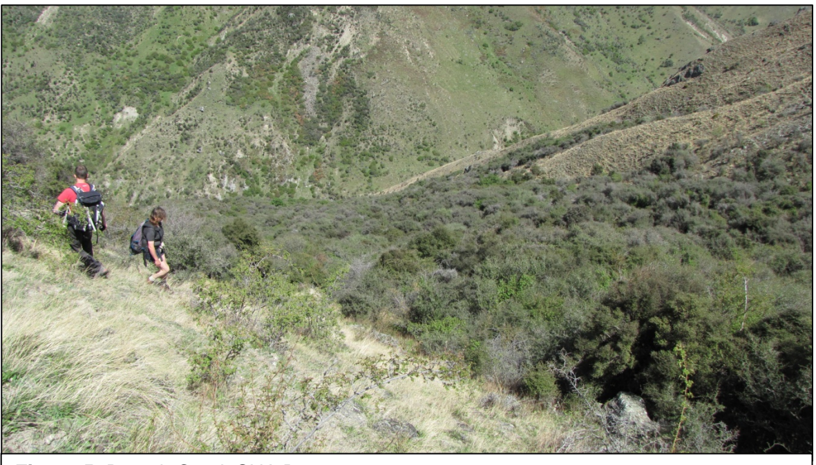
Figure 5: Branch Creek SNA B.