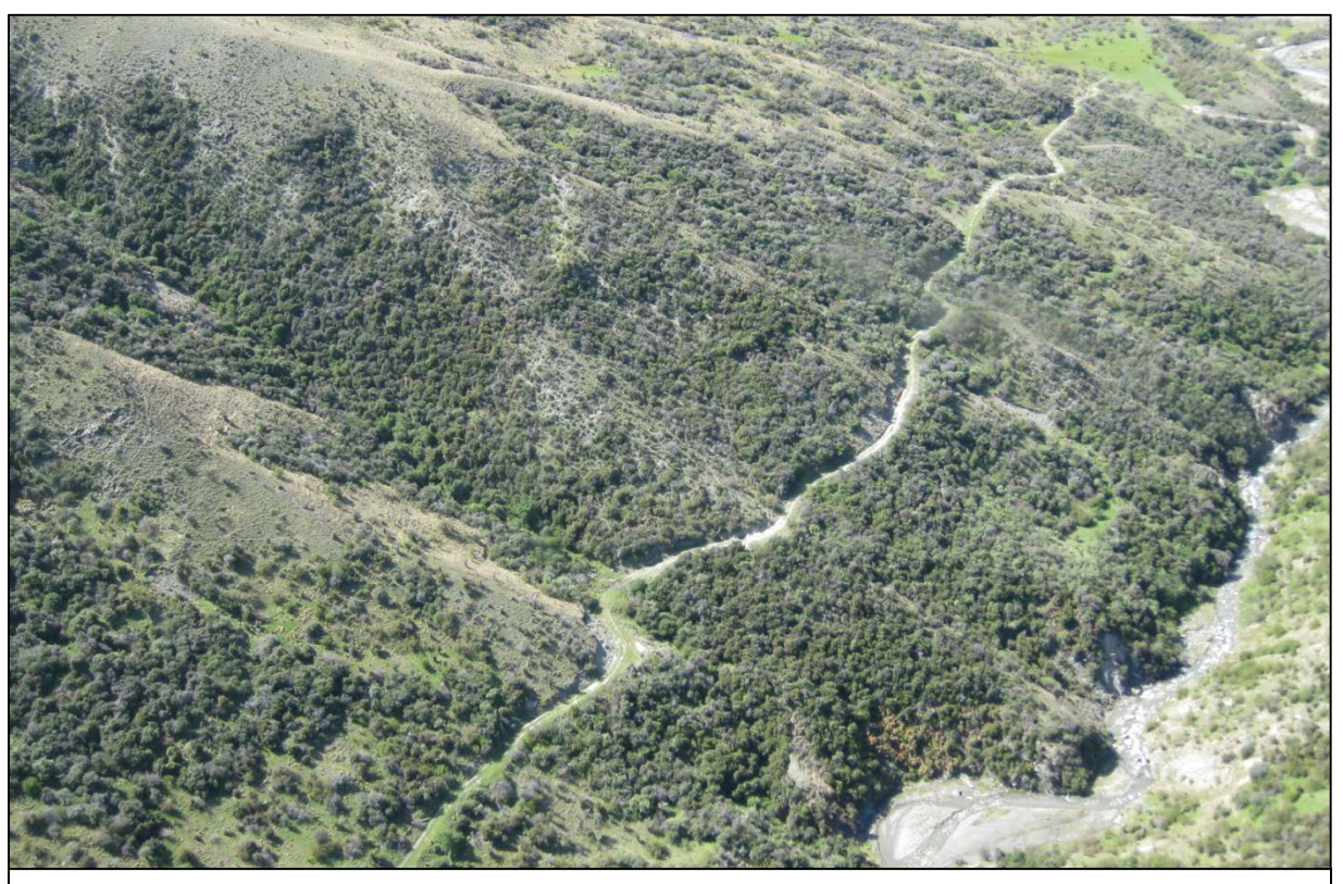
Figure 3: Branch Creek SNA B.