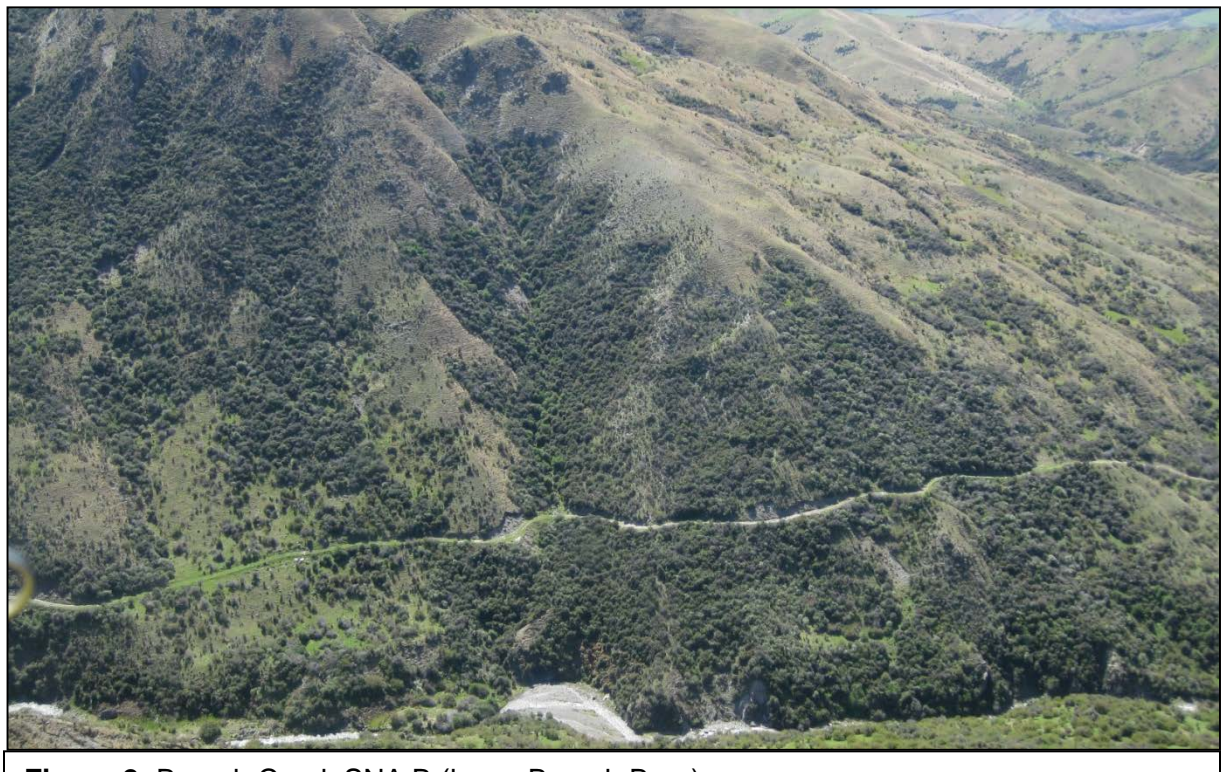
Figure 2: Branch Creek SNA B (lower Branch Burn).