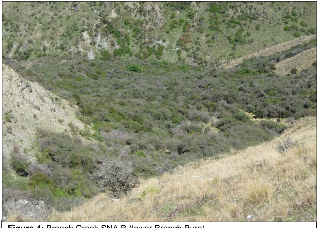
Figure 4: Branch Creek SNA B (lower Branch Burn).