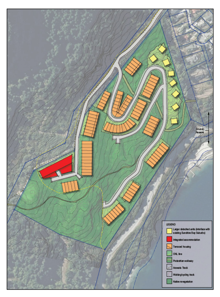
Figure 3: Indicative Master Plan

As Figure 3 illustrates, the site is accessed from Arawata Terrace via the existing legal road corridor and a new T intersection with Arawata Terrace. Provision is made for pedestrian access to be maintained to access the Arawata Track. The development concept sleeves the existing Sunshine Bay urban area with a single row of detached dwelling typologies, before moving towards finer grained unit and terrace style development, and a few areas that could accommodate low rise apartment buildings. The proposed layout enables use of the site gradient for undercroft parking while maximising views across the lake toward The Remarkables.