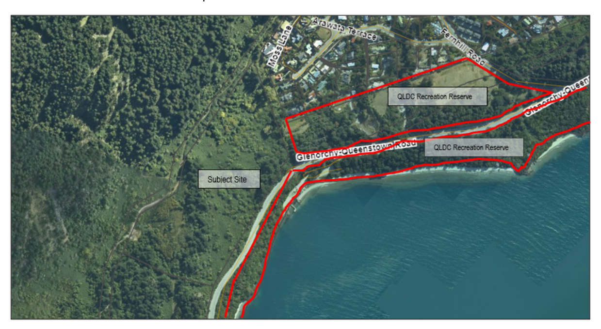
Figure 4: Proximity of existing reserves

The owner intends incorporating further reserve spaces at the detailed design stage. The opportunity may or may not exist for a 3000m² Local Park, notably by virtue of topographical constraints. At this stage of considering a rezoning request, the detailed subdivision layout has not been developed, and this is a matter for further consideration. The site directly adjoins a large public reserve shown in the image below, and the proposed trail will connect this reserve to the development.