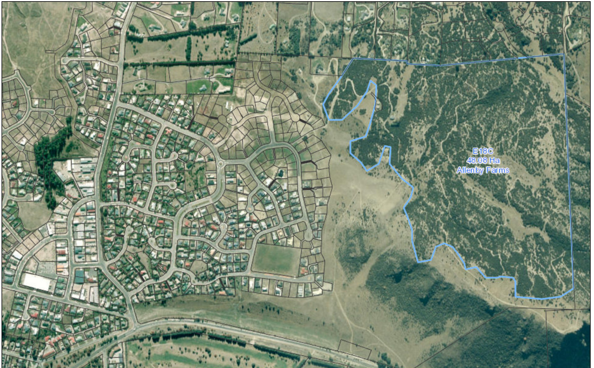
Figure 1: The area of potential significance - Mt Iron SNA C - E18C.