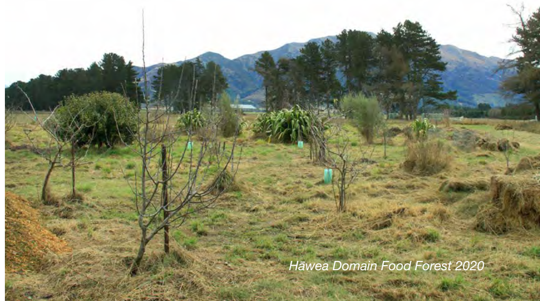
Hāwea Domain Food Forest 2020

The Domain is otherwise sited on flat land with an agricultural/rural character. The location of the Domain between Hāwea Lake and Hāwea Flat is a 'central Hāwea meeting place', which 'unites the two communities'.