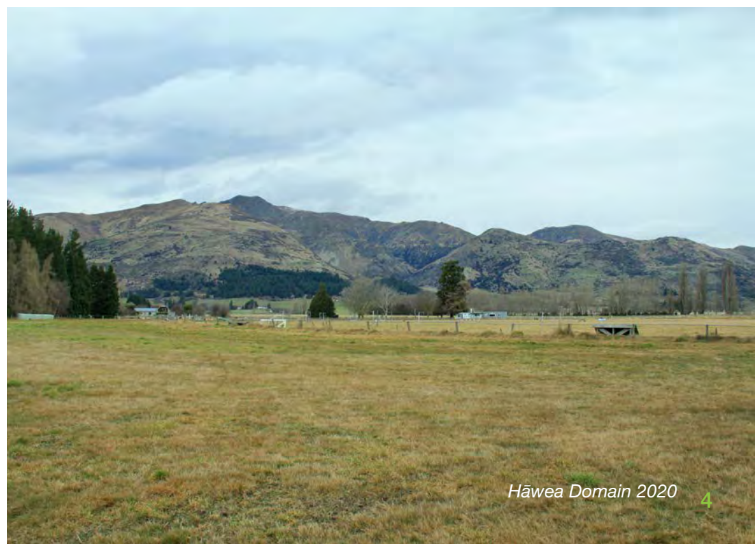
Hāwea Domain 2020