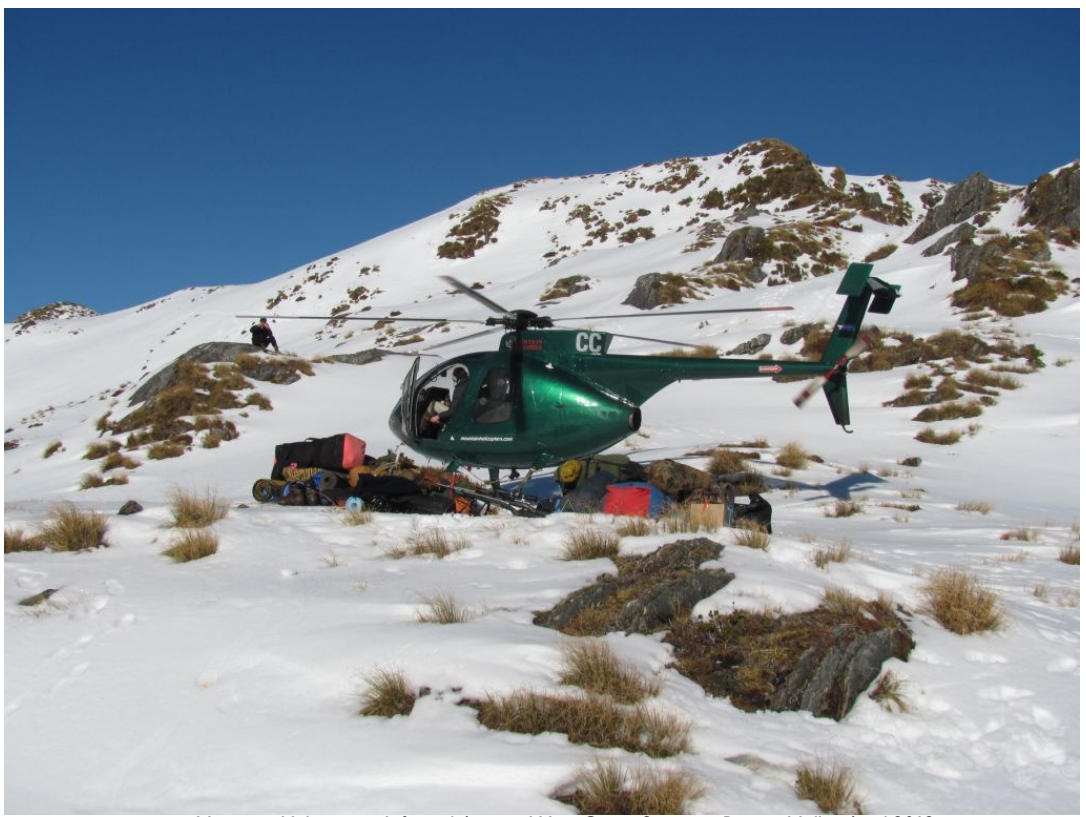
Mountain Helicopters Informal Airport West Coast.

In regards to temporary or "one off" aircraft landings the Council also has no specific rules or other provisions to control these types of landings.