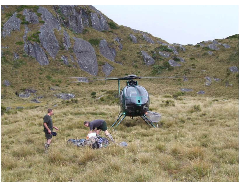
Mountain Helicopters Greer Stream Jacobs River.

However, as identified in Section 4.1 above, the Departments assessment of effects is restricted to only the effects on the Public Conservation Land which it administers. The assessment and decisions cannot legally include methods for the mitigation of effects on parties outside of the Public Conservation Land in question.