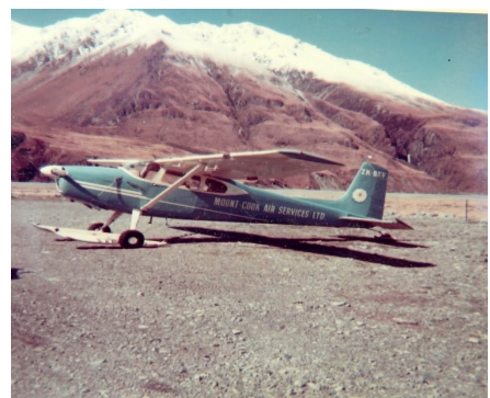
Source - http://rnzaf.proboards.com/index.cgi?board=agricultural&action=print&thread=12321

Accordingly, it is considered that any aircraft landing concession granted by the Department of Conservation on Public Conservation Land has been fully, comprehensively and adequately assessed and ultimately, deemed consistent with the values specific to the Public Conservation Land upon which it is proposed to be undertaken and the users of that land.