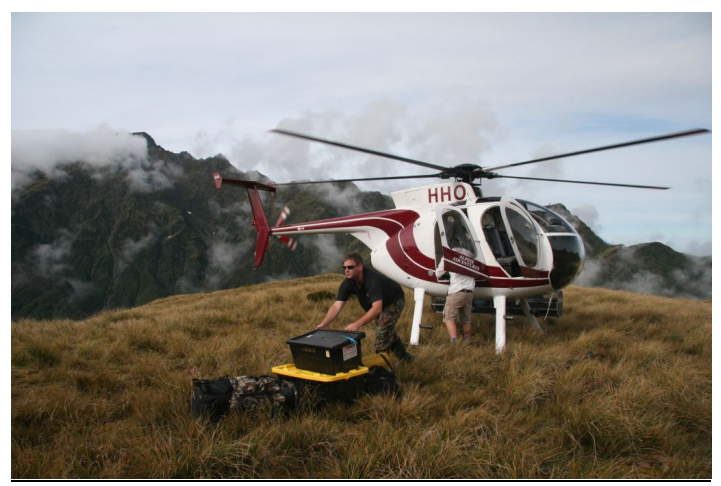
Hunters Departing an Informal Airport.

From an aircraft operator's perspective, this unnecessarily increases costs to their business as well as adding an additional on-going compliance monitoring requirement i.e. annual activity returns for each airport, for each statutory body, and at different times of the year.