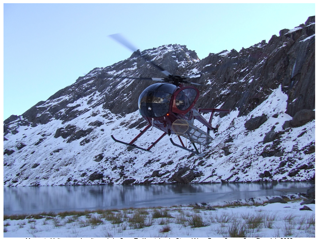
Mountain Helicopters Landing at Lake Roto Te Koeti, Jacobs River, West Coast. Source Sean Dent July 2009

The rules for aviation activities in the Rural Zone deal with all potential informal airports including setting a Permitted Activity threshold to allow for temporary or infrequent use of airports being five excursions (landing and take-off) per week from a property.