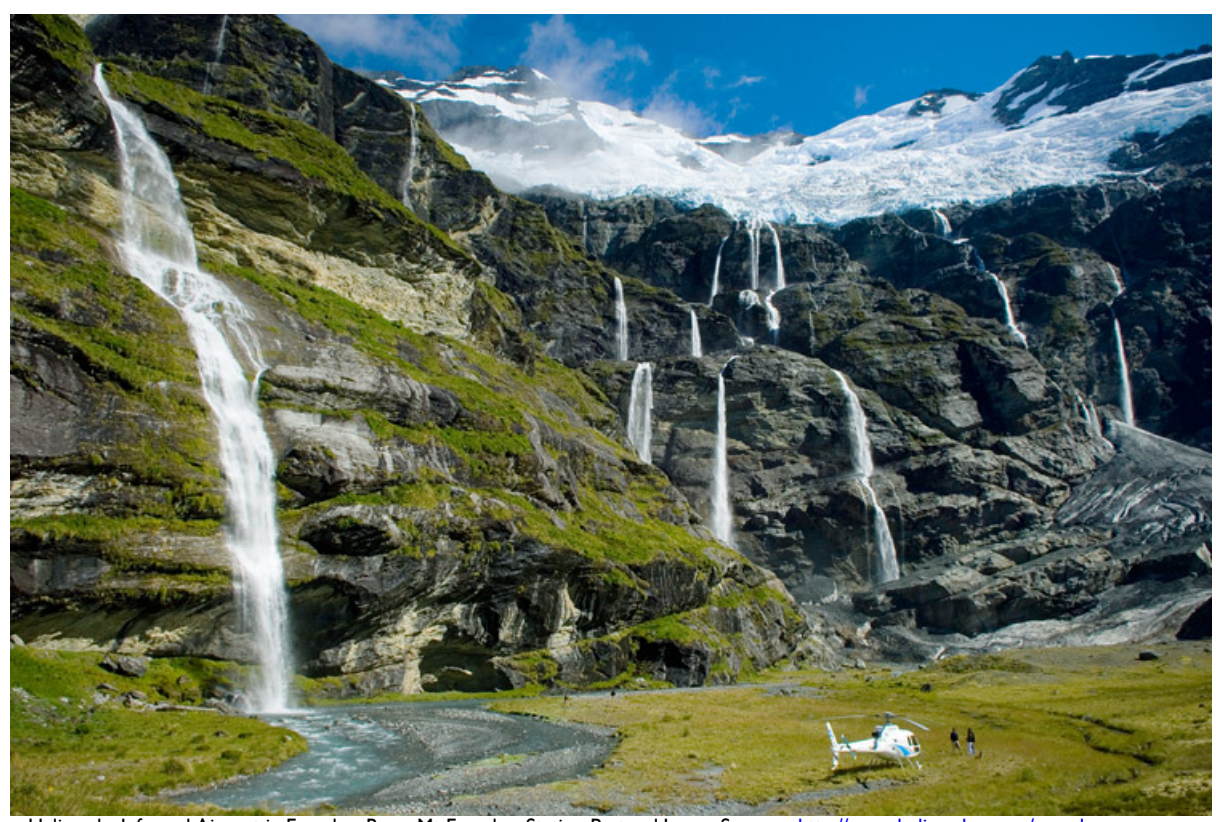
Heliworks Informal Airport in Earnslaw Burn, Mt Earnslaw Station Pastoral Lease.