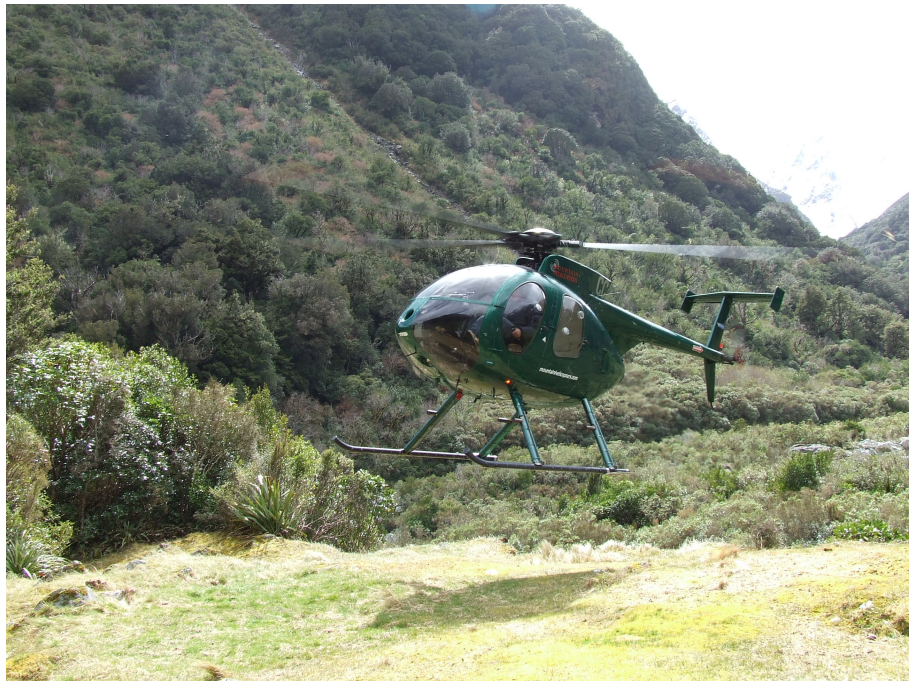
Mountain Helicopters Landing in the Butler River, West Coast 2007

Subsequently, any future changes to the existing District Plan provisions regarding informal airports in the Rural General Zone and on Crown Pastoral Land would need to account for this difference in assessment.