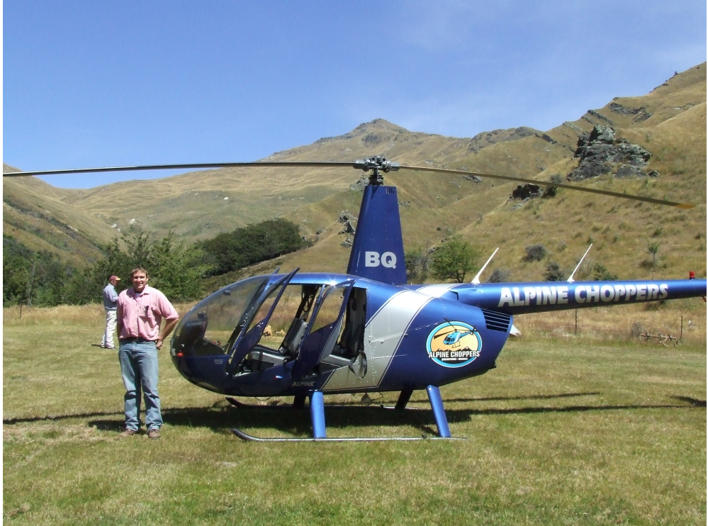
Alpine Choppers R44 Contracted by Civic Corp and Landed Near Ben Lomond Station January 2006.

A copy of the relevant provisions from each Districts plan is also appended to this report as Appendix [B] .