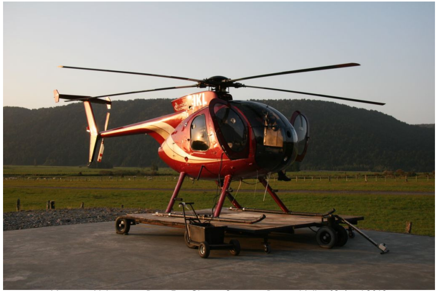
Mountain Helicopters Base, Fox Glacier.

Additionally, while Rule 6.5(d) refers specifically to helipads it also refers to "similar types of leisure activities". Leisure activities are not defined in the WDP either however, discussions with Mr Simpson have confirmed that this rule would also encapture informal airports or airstrips for fixed wing aircraft.