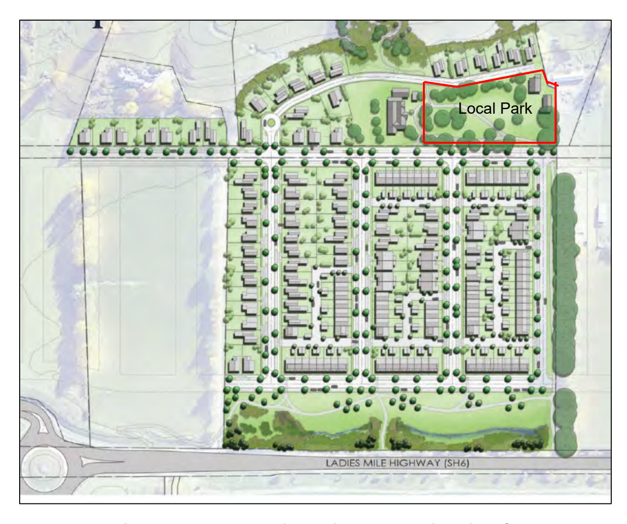
Figure 2: Masterplan of the Flint's Park residential EOI