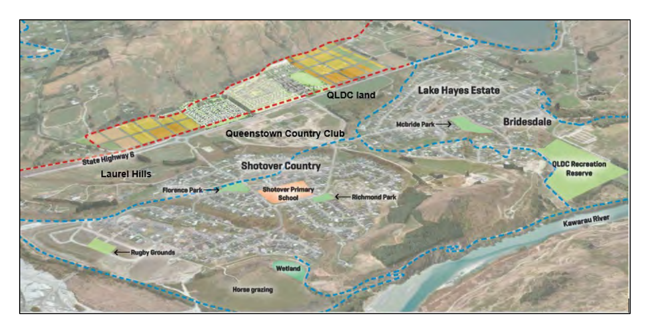
Figure 10: Site layout in the context of the wider Ladies Mile area (extent of Florence Park incorrectly shown)

Strategic Direction (Point 3.2 of the Lead Policy)