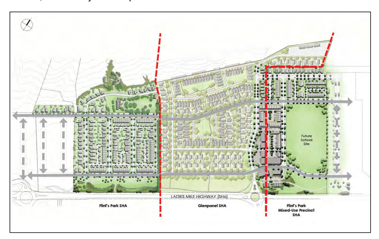
Figure 1: Combined Masterplans for (left to right) Flints Park, Glenpanel & Flints Park Mixed Use