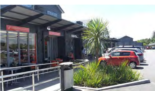
Figure 7: Photographs of the Stonefields commercial area illustrating the type of development envisioned in the Mixed Use precinct.

42 Density: Figure 8 below shows the Flint's Park Mixed Use Precinct is located mainly within the High Density and Mixed Use local centre area on the Indicative Master Plan. The Lead Policy anticipates a density of around over 30 households per hectare in both areas. The proposal has a gross density of 24 households per hectare (excluding school site and Ladies Mile setback). The density is therefore less than anticipated in the Indicative Master Plan, most likely due to the small number of above floor apartments anticipated by the Indicative Master Plan above the ground floor commercial activities plus the State Highway setback.