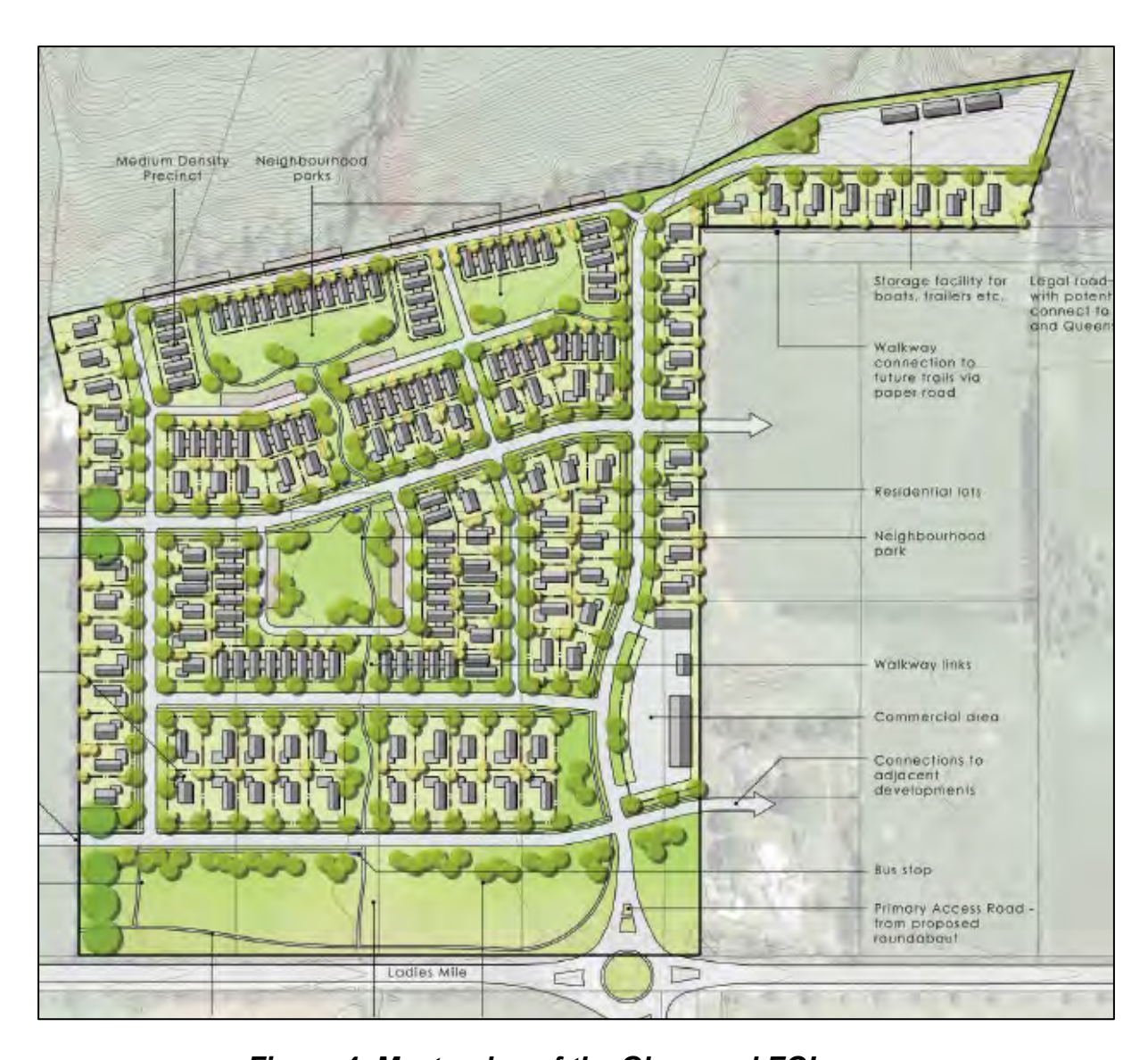
Figure 4: Masterplan of the Glenpanel EOI