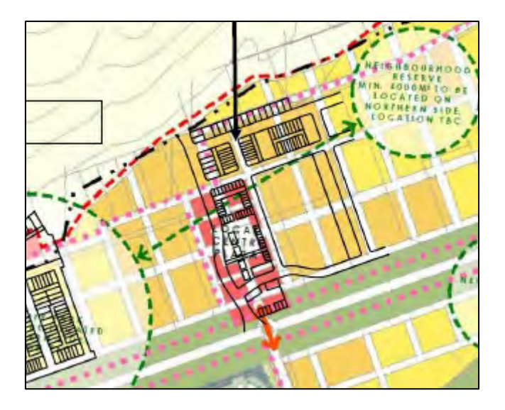
Figure 8: Flints Park Mixed Use Precinct overlaid on the Indicative Master Plan.