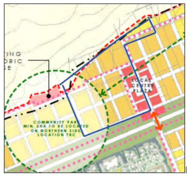
Figure 5: Glenpanel in context of Indicative Master plan