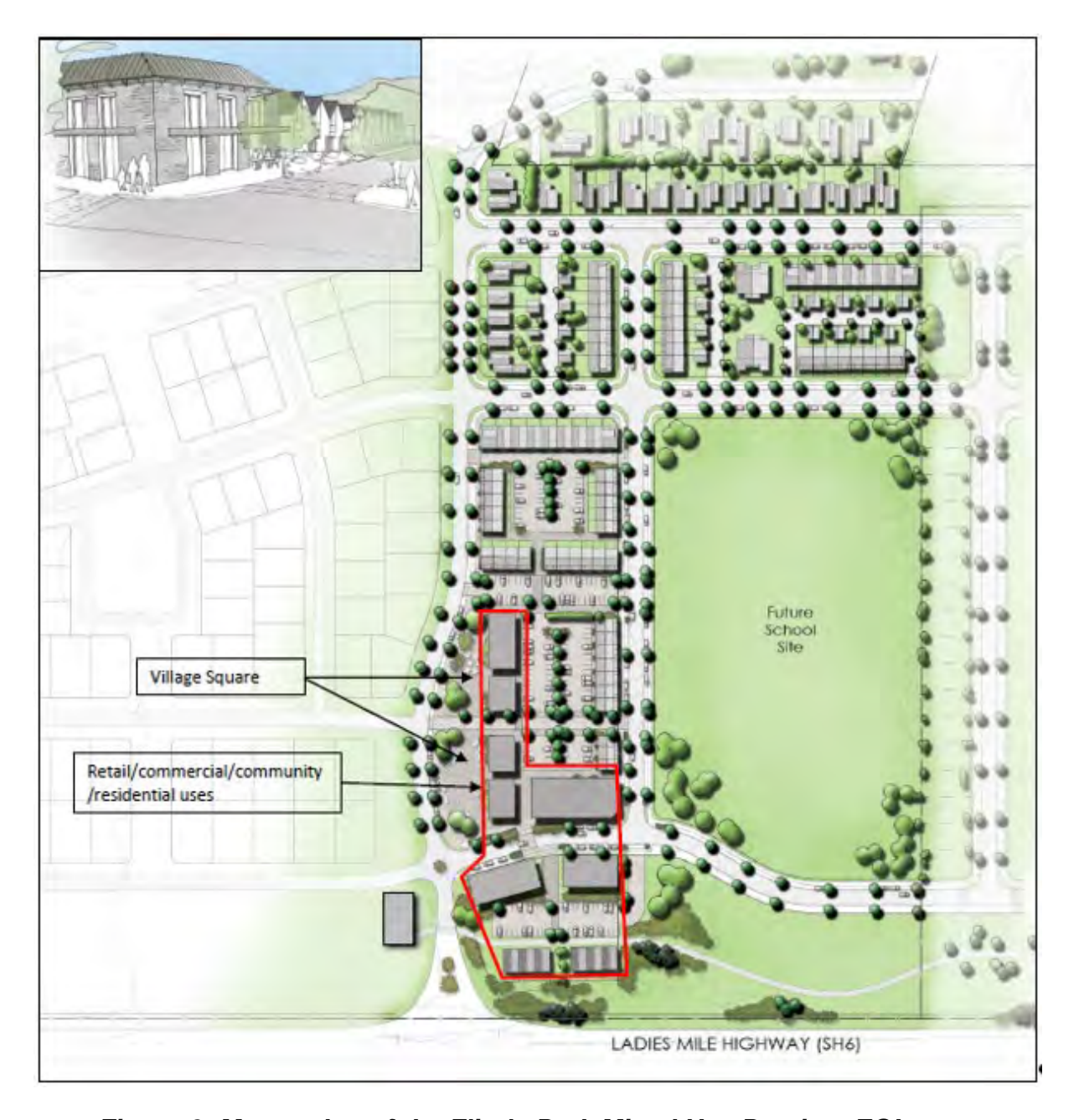
Figure 6: Masterplan of the Flint's Park Mixed Use Precinct EOI