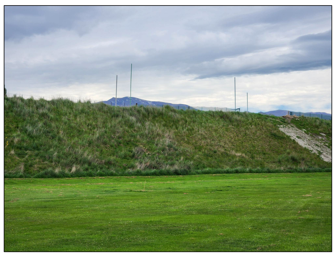
Figure 3: Photograph from near dwelling #2 on Site showing 5.5m profile poles significantly breaching the skyline and overlooking the site.