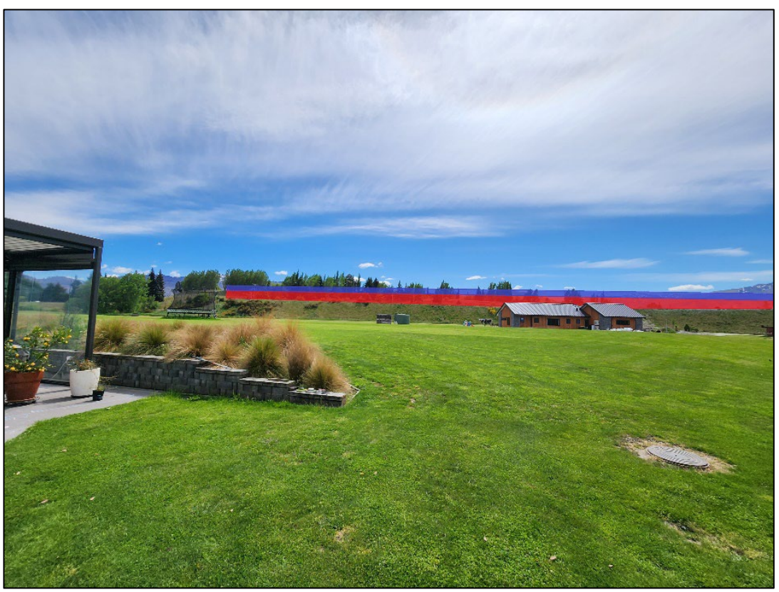
<u>Figure 5</u>: Modified photograph from dwelling #1 on Site showing area depicting 5.5m profile poles (in red) and the 8m height (in blue) - heights shown are approximate only.