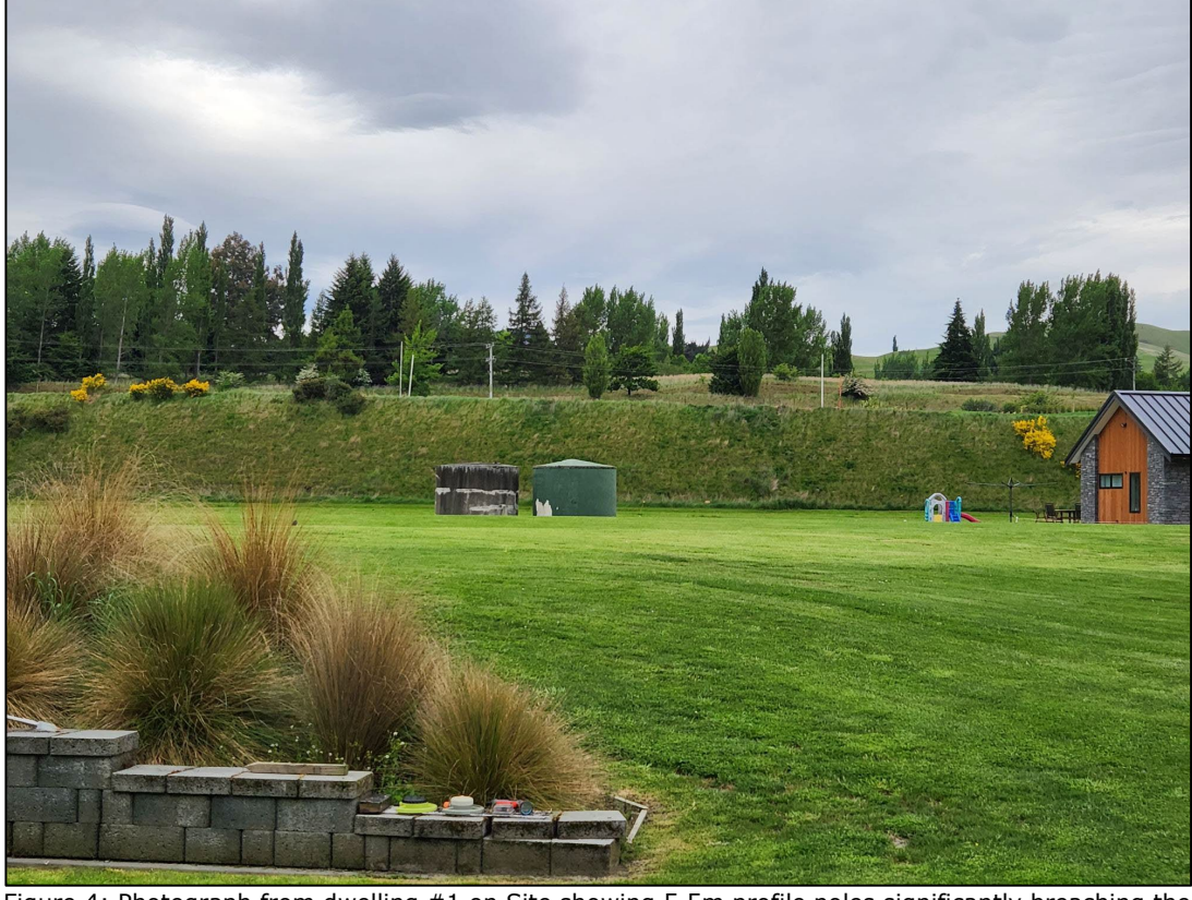
\frac{\text{Figure 4}\text{: Photograph from dwelling } \#1 \text{ on Site showing 5.5m profile poles significantly breaching the skyline and overlooking the site.}