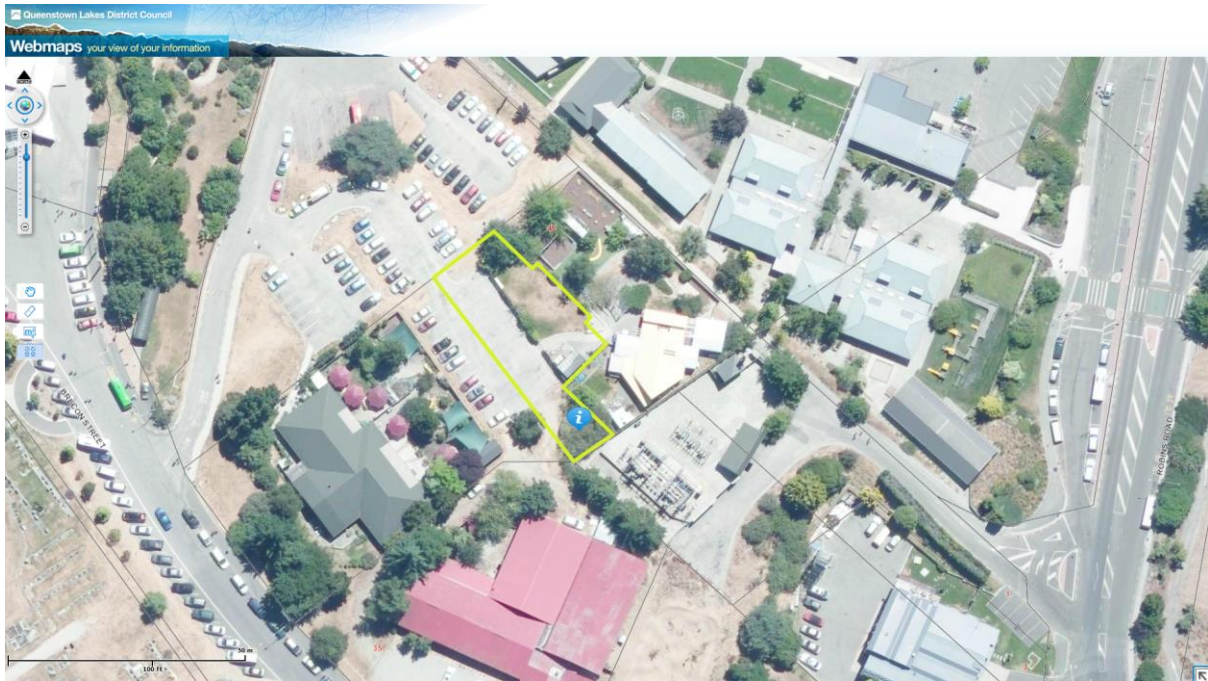
Figure 2 – Section 1 SO 24543 Highlighted in Yellow.