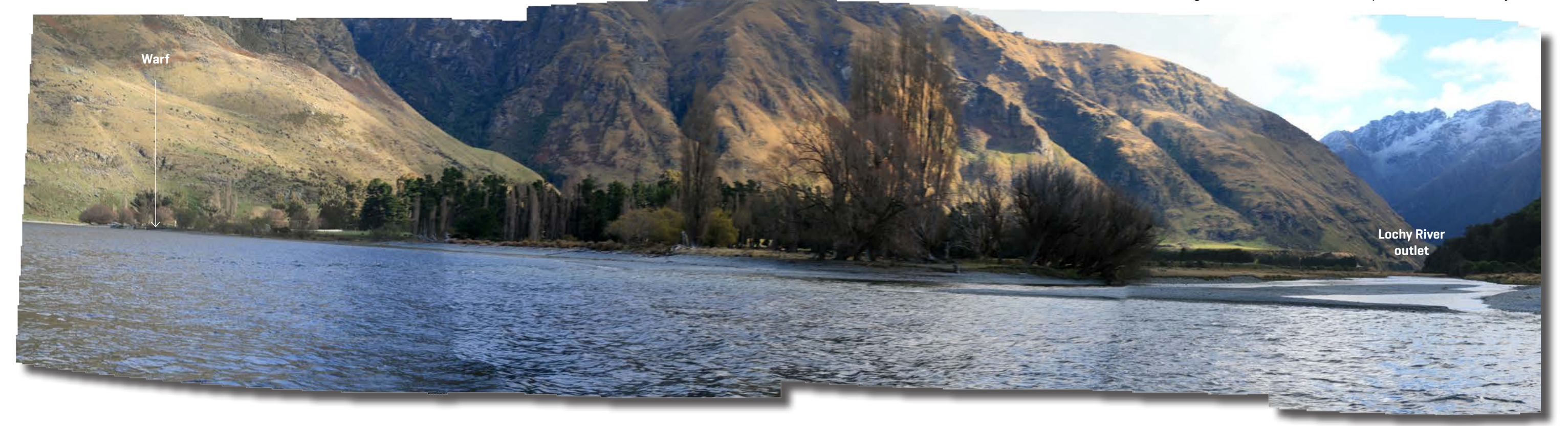
Image 2: Image is a spherical composite of 5 photographs taken with a 50mm focal length on June 4th, 2017 at 1:27 pm. For reference only.