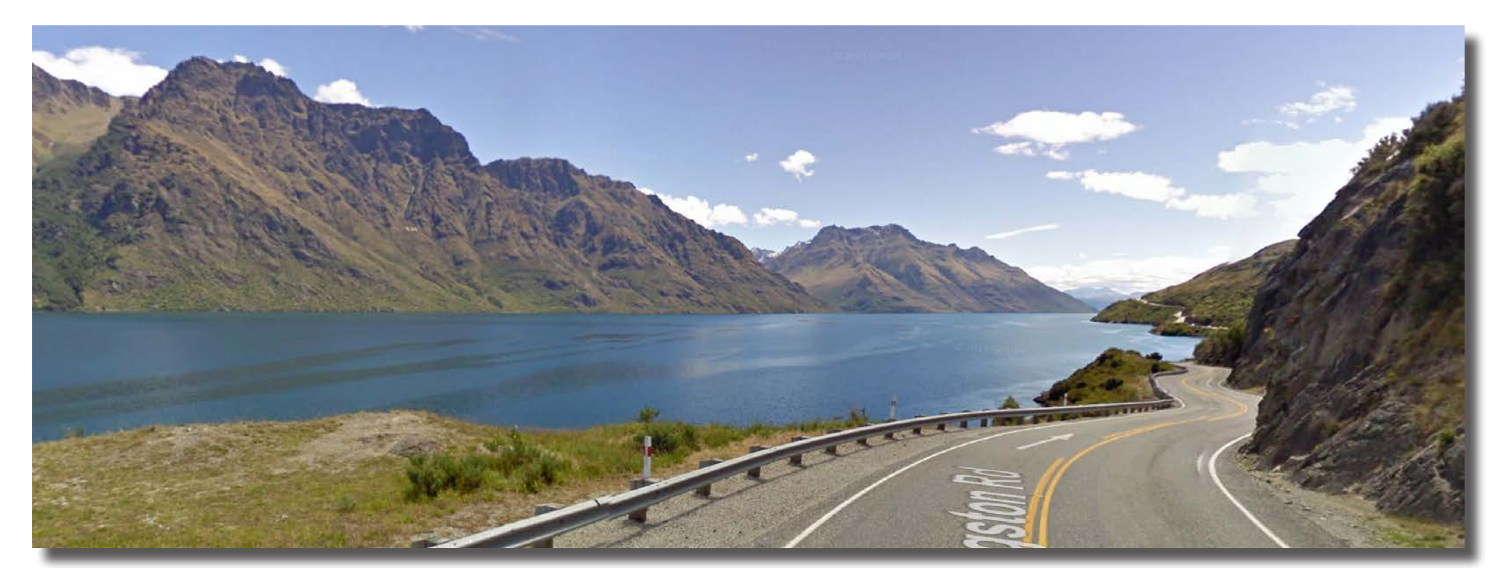
Image 3: Image from the Devils Staircase lookout sourced from Google Street View. For reference only.