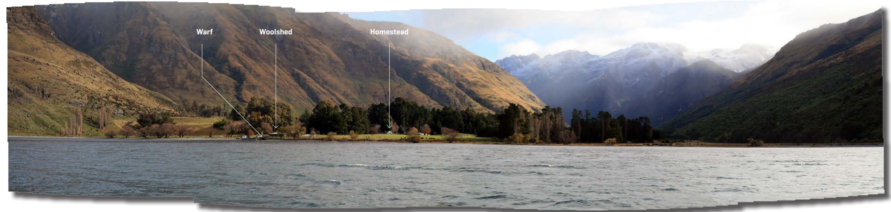
Image 1: Image is a spherical composite of 5 photographs taken with a 50mm focal length on June 4th, 2017 at 1:23 pm. For reference only.