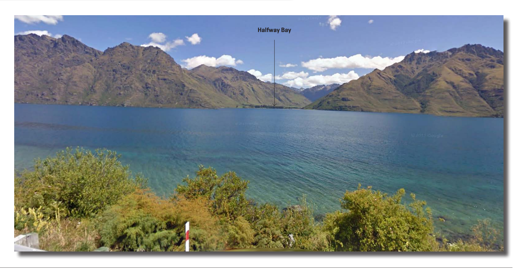
Image 4: Image from the Kingston Highway immediatly east of Halfway Bay. For reference only.